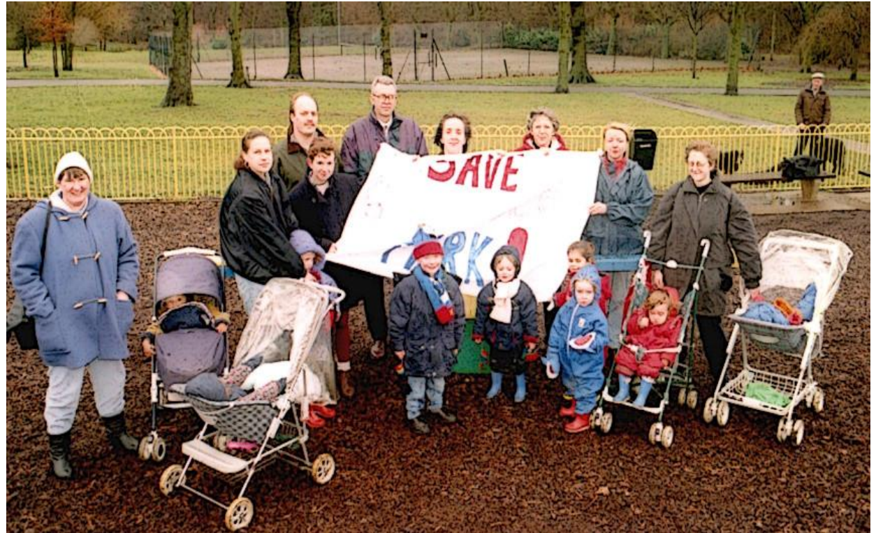
Image: Save the park campaign, 1997

The trustees are pleased to present their Annual Report and Accounts for the year ended 31 December 2022