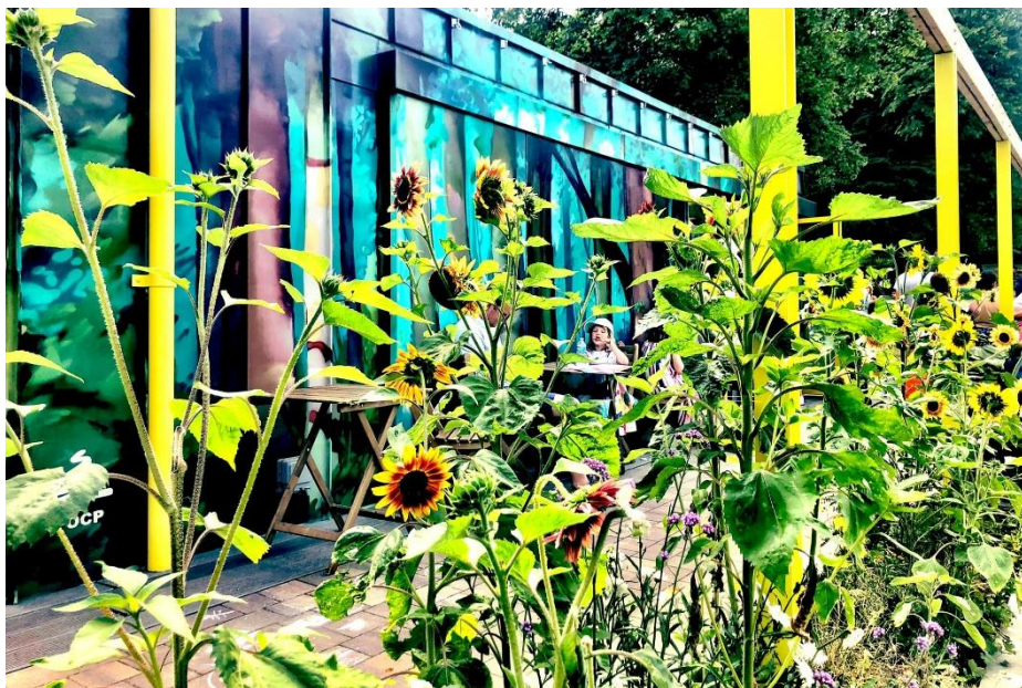
Image: The Shed with its Summer sunflowers

The Shed celebrated its 2nd birthday in August 2022.