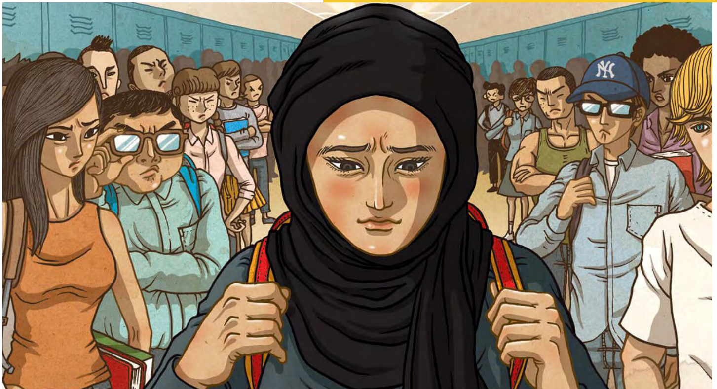
ILLUSTRATION BY DONGYUN LEE

Delivering nutrition and fitness programs that combine physical activity with education. Providing mental health counselling tailored to the unique needs of the community.