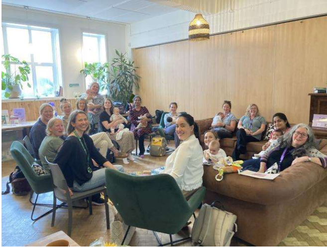
Maddie's Miracle Breastfeeding Community Group, Bournemouth (2024)

The trustees present the annual report together with the financial statements of the charity for the year ended 31 December 2024.