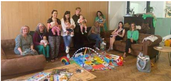
Maddie's Miracle Bournemouth Breastfeeding Community Group

These partnerships ensure that our support remains integrated within broader community and healthcare frameworks.