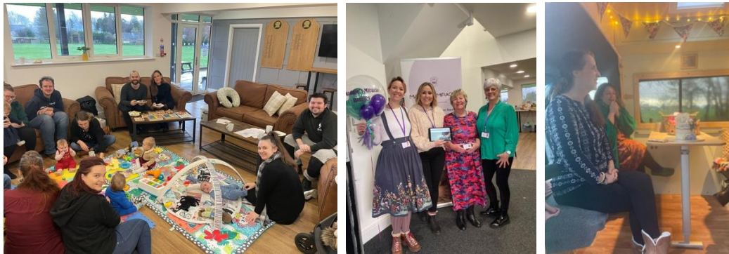
Pictures from the 1-year anniversary of Maddie's Miracle Ramsey (Cambridgeshire) Breastfeeding Support Group

Our first Maddie's Miracle in-person group in Ramsey, Cambridgeshire celebrated its 1-year anniversary in November 2023. We have received a great deal of positive feedback from mothers, parents and families who attend this group.