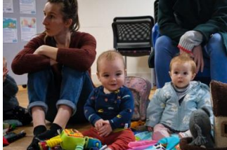
Maddie's Miracle Ramsey Breastfeeding Support Group

Our local groups are in-person breastfeeding support groups that are imbedded within the heart of a community.