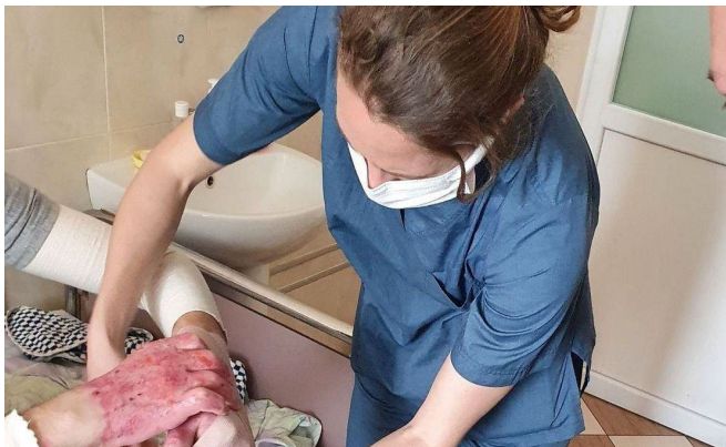
Humanity and Inclusion, Ukraine