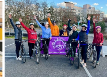
Harrow Giving – selected grantees for loneliness project