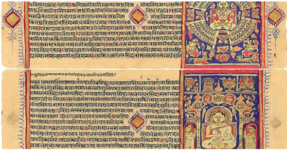
SOAS, Centre of Jain Studies