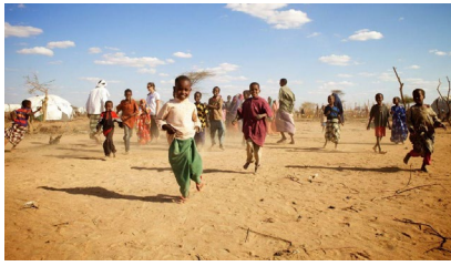
Humanity and Inclusion, Kenya – Inclusive Schools Project in Dadaab and Kakuma refugee camps, Kenya