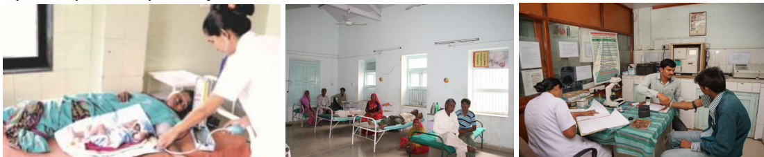
Community Health Centre, Sayla; new Science Centre, Sayla