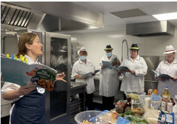
School Plates by Proveg