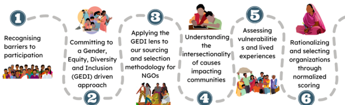
Dasra's Rebuild India Fund