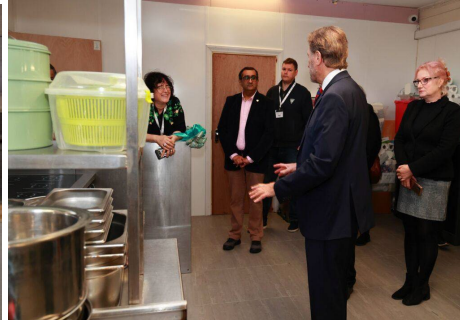
Gratitude's New Kitchen, Borehamwood, Hertfordshire, England