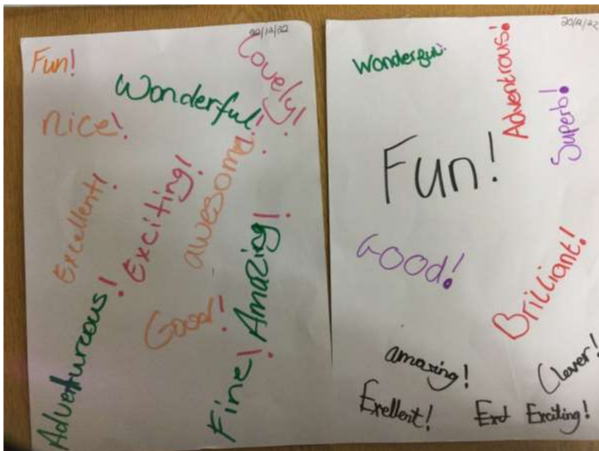
Expressions from our service users – Children and Young People.