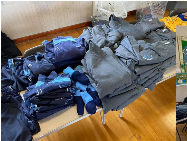
Uniform Table Top Sale