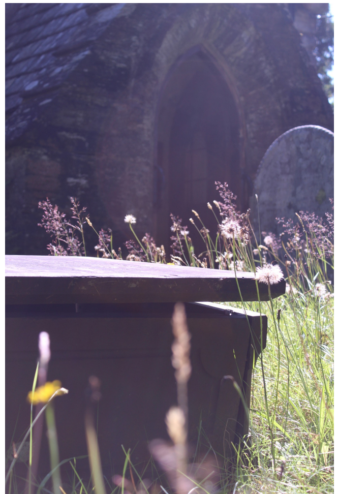
Dolwyddelan Churchyard Summer 2024