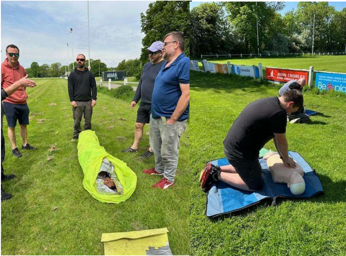
Adult volunteers first aid training at AKRFC

Our rolling programme of adult leader training, which has previously covered areas such as safeguarding, covered First Aid training this year. During the year we invested in First Aid training