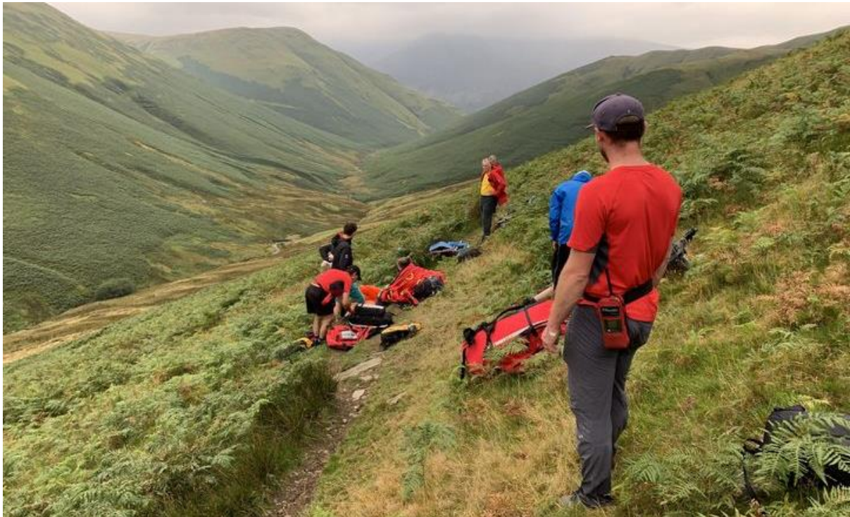
Keswick Mountain Rescue Team attending one of our Gold expedition teams

15 members successfully completed their Qualifying expedition, and we are hopeful that a substantial number of these will complete the full Award.