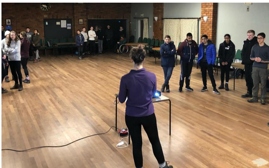
Bronze Training at Antrobus Village Hall