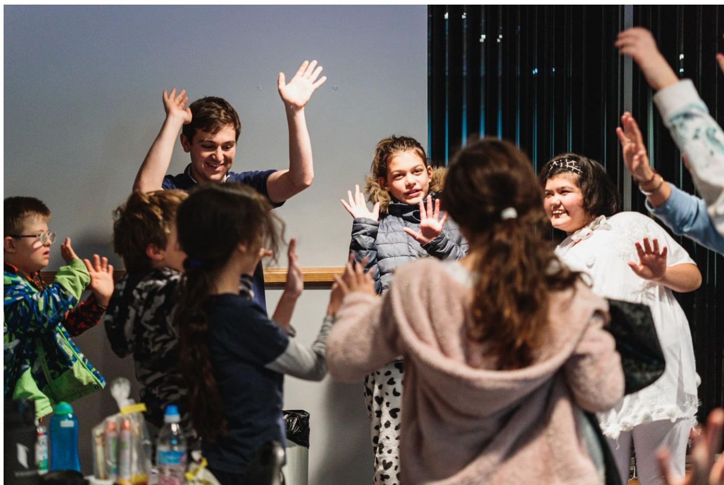
Stevenage Children's Theatre taking part in a warm up exercise – November 2021