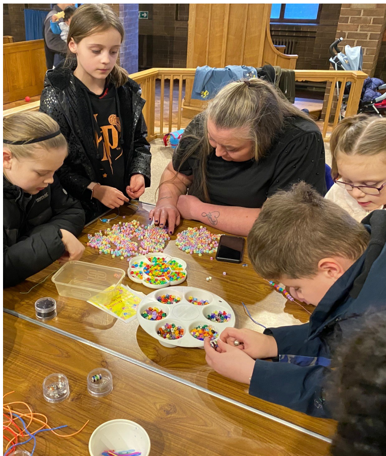
Creating fun in the holidays