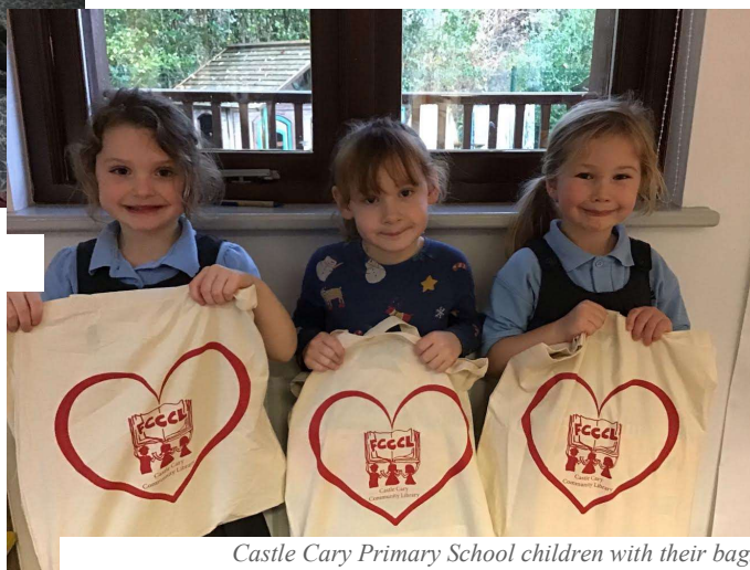
Castle Cary Primary School children with their bags

The Co-op grant, awarded to us early in the financial year and mentioned in last year's report, was intended for library-related events which we have been unable to put on. However with the Co-op's permission we were allowed to migrate the funding to an exciting project with Castle Cary Primary School, every child receiving a free book bag which they can now send to the library as a request to borrow books. Over 50 children have taken advantage of the scheme.