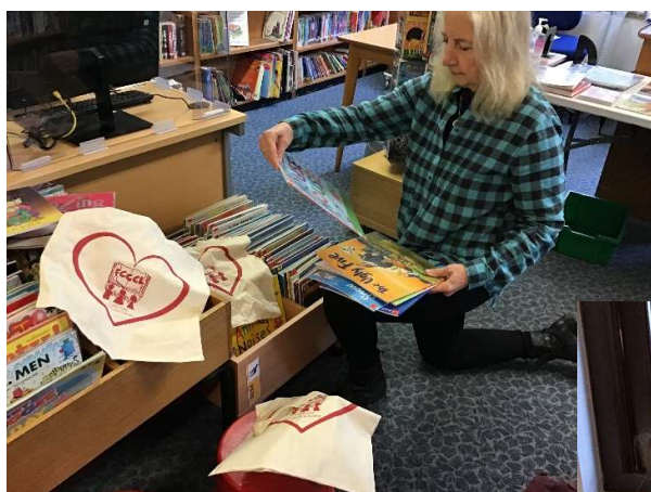
Choosing books for the children

We have not been idle during lockdown. Our desk volunteer team has