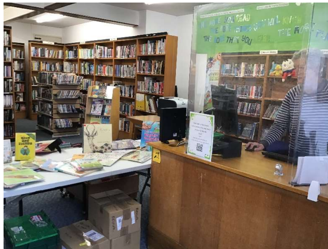
Covid-19 arrangements at the Library Issue Desk