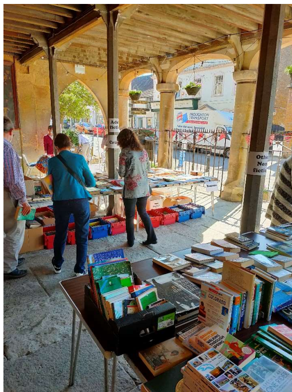
We eventually managed to hold a Book Sale in May 2021, and raised £700