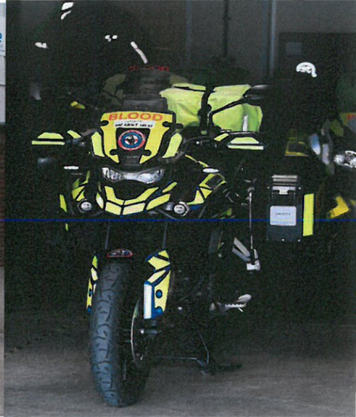
Above: Grace Trust Funding

In the last financial year, the charity has managed to secure funding for vehicles one car and two bikes.