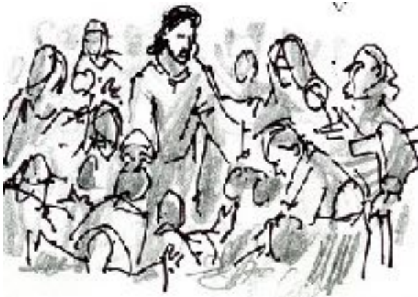
God hears the cry of the poor

Positive visits, connections and follow-ups continue to be made through our successful community outreach initiative, 'Street Prayer'.