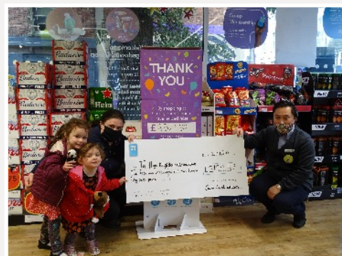
Co-op's kind donation of £2,190 to HKCA