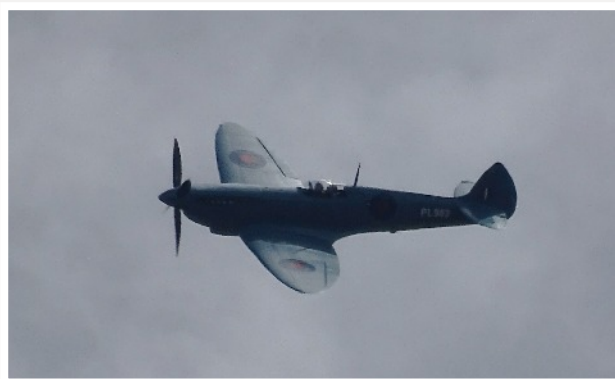
"Thank You NHS" Spitfire Over BRI Hospital