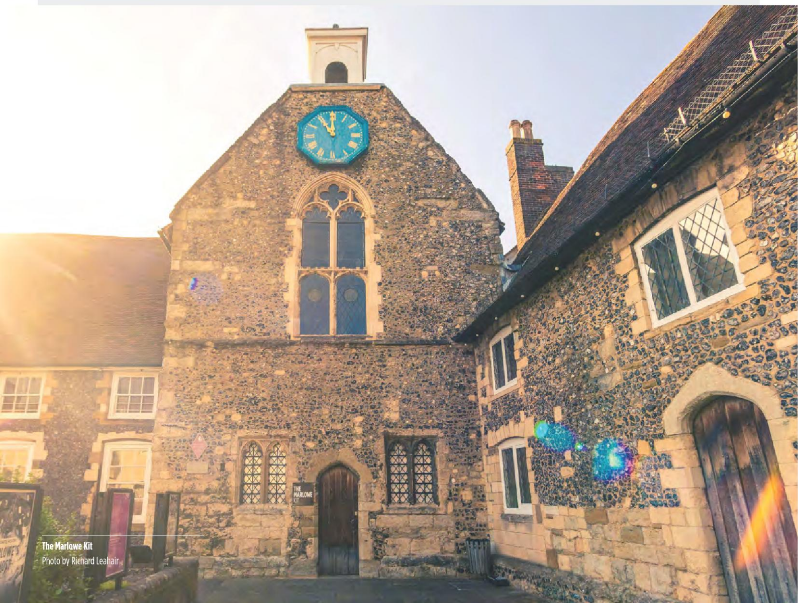
The Marlowe Kit

Both projects speak to the city and region's regeneration and economic growth agendas, and our long term investment plans will provide jobs, training facilities and pathways into the performing arts for the next generation of Kent-based theatre-makers.