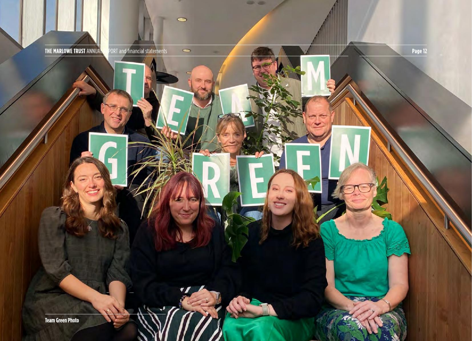
Team Green Photo

The People Plan made a commitment to encourage teams to visit peer organisations to exchange knowledge and experience. So far, Development, Technical and Learning & Participation teams have arranged visits to their peers in theatres in the Midlands and Chichester Festival Theatre. Our teams are connecting with - and on occasion setting up - national peer networks, for support and to disseminate best practice in their areas. As a result we are a more outward-looking and confident organisation.