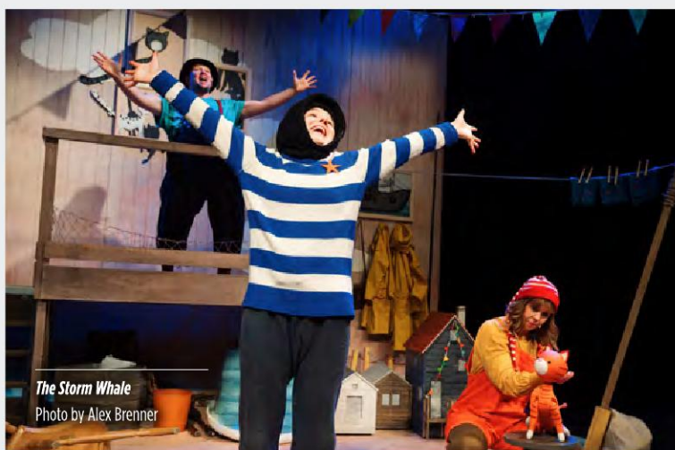
The Storm Whale

Sleeping Beauty was one of the highest attended pantomimes in the country, playing to an audience of 89,000 during its run. The star power of West End and YouTube sensation Carrie Hope Fletcher allowed us to engage with digital and millennial audiences to grow the following of our pantomime online.