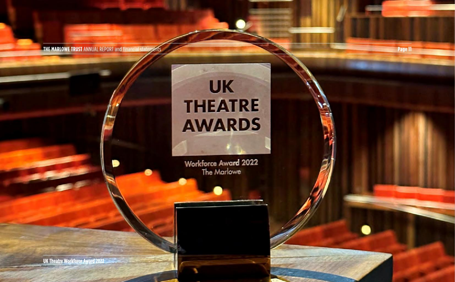
UK Theatre Workforce Award 2022