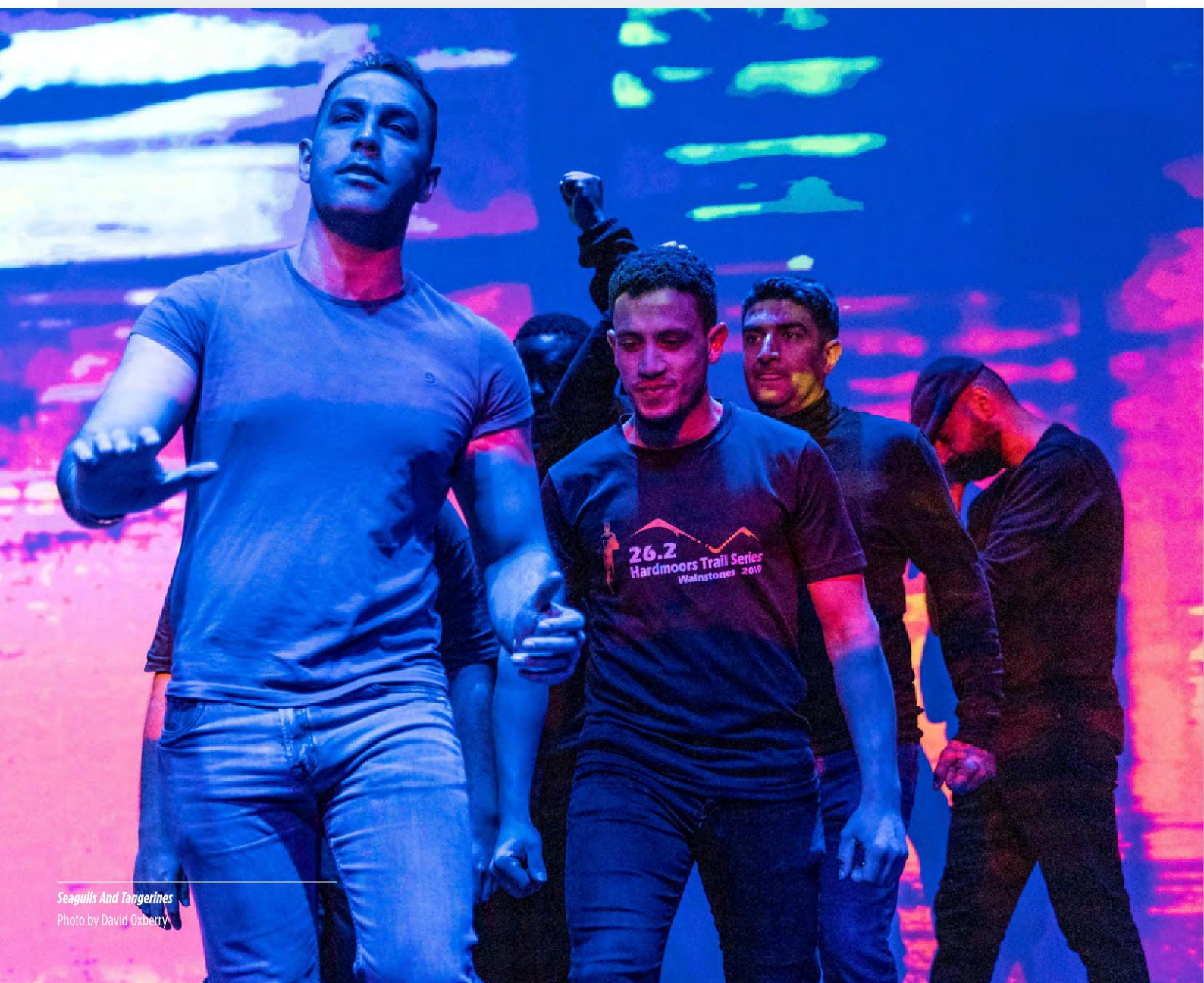
Seagulls And Tangerines

We also worked in partnership with resident company Projekt Europa to host Projekt Encounter, a weekly performance-based programme for people with lived experience of migration to Kent. The project included 18 weeks of drama-based activity for over 20 first generation migrants to Kent, focusing on sharing their stories and establishing new communities and connections. The project culminated in a public sharing in the Studio of their devised piece Seagulls And Tangerines .