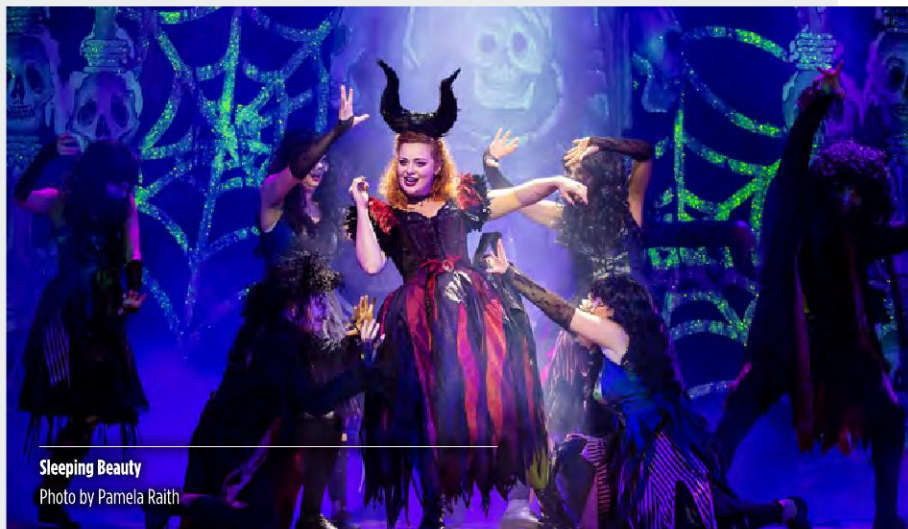
Sleeping Beauty

Across the festive season, we focused on co-produced work, collaborating with our pantomime partners Evolution Productions on Sleeping Beauty , and picking up our pre-Covid co-commission for the Studio The Storm Whale , presented in partnership with York Theatre Royal, Engine House and Little Angel.