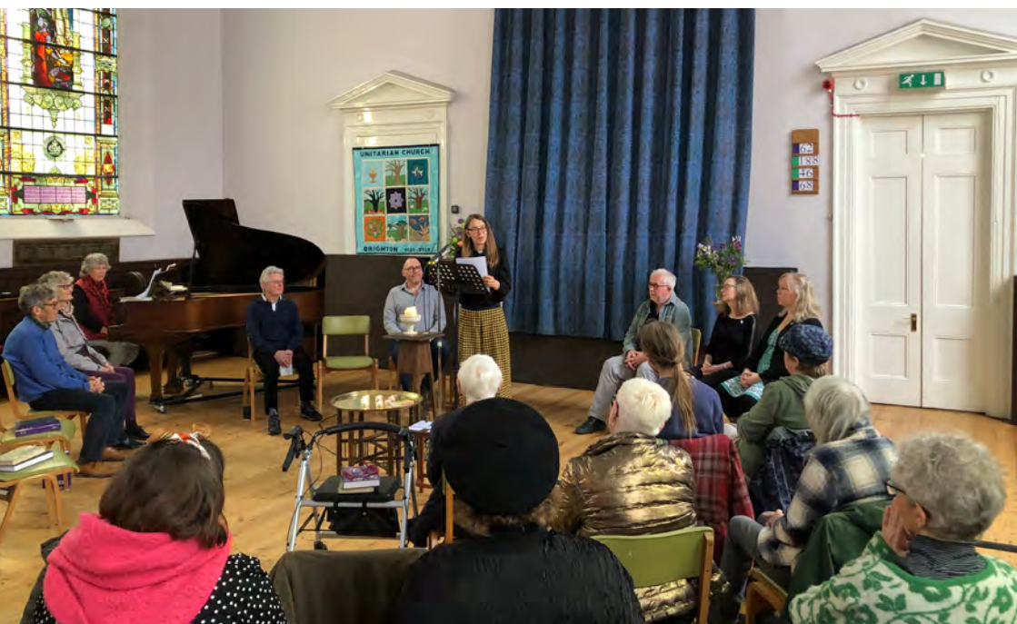
PICTURED LEFT We welcomed 7 new members to the church in our first membership service