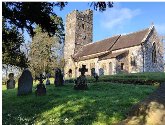
All Saints, Huntsham