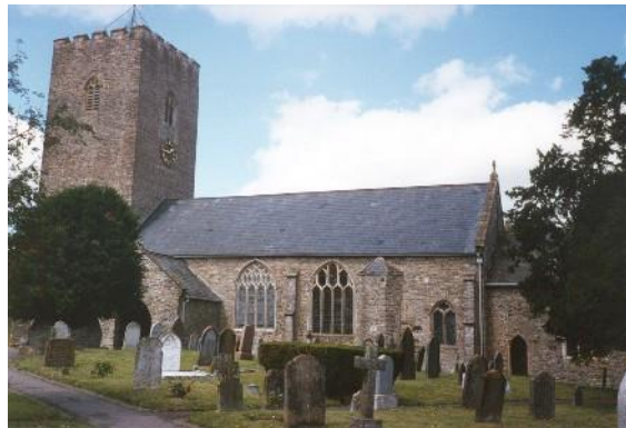
St. Michael's and All Angels, Bampton