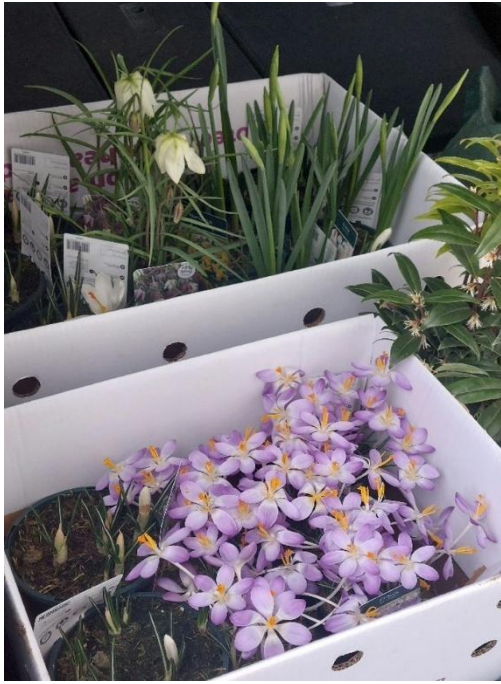
Plants acquired and ready to go to the Park in early Spring 2025.