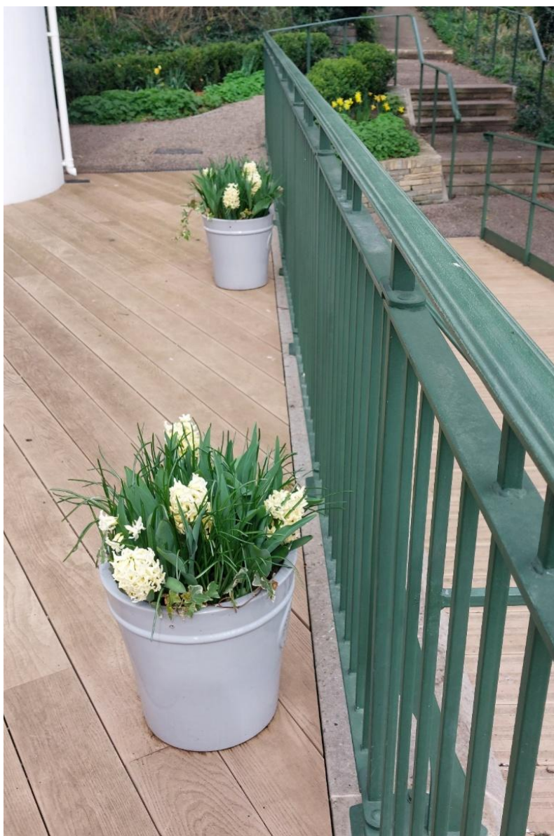
Friends' Spring 2025 pots – lemon-cream coloured hyacinths, an old variety, called 'City of Haarlem' (1893) – with tulips and Ornithogalum growing below them, to follow on.

[Front cover image: The Friends using the compost supplied by Tate & Lyle, filled the first section of the gutter on the Inner Bailey events lawn in the spring of 2025.]