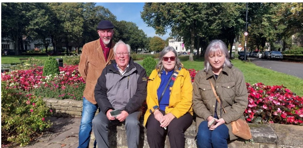
Trustees taking a good look at Port Sunlight Village Trust's horticultural work (in October 2024).

We will consider updating our training lecture modules to suit a further batch of new volunteers.