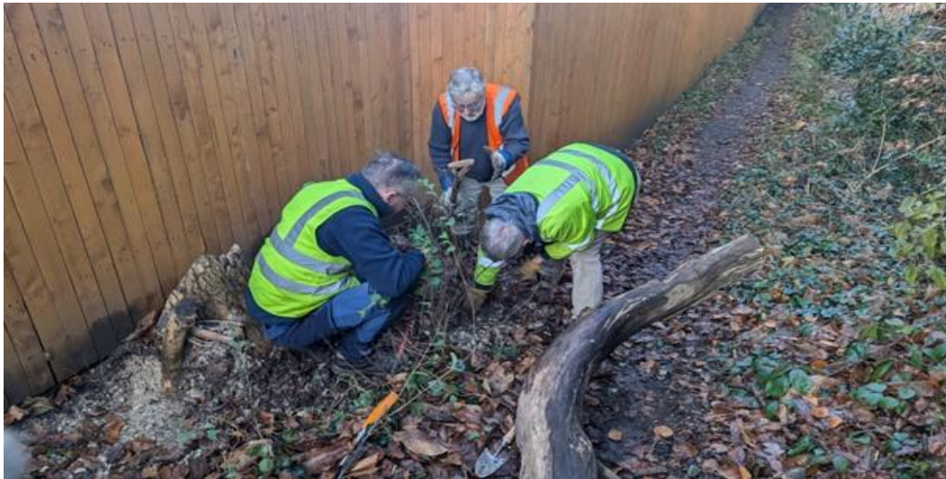
Friends removing waste metal found within the Perimeter Path, which was becoming hazardous (in November 2024).

Friends also do small tasks to keep the paths passable, removing small hazards.