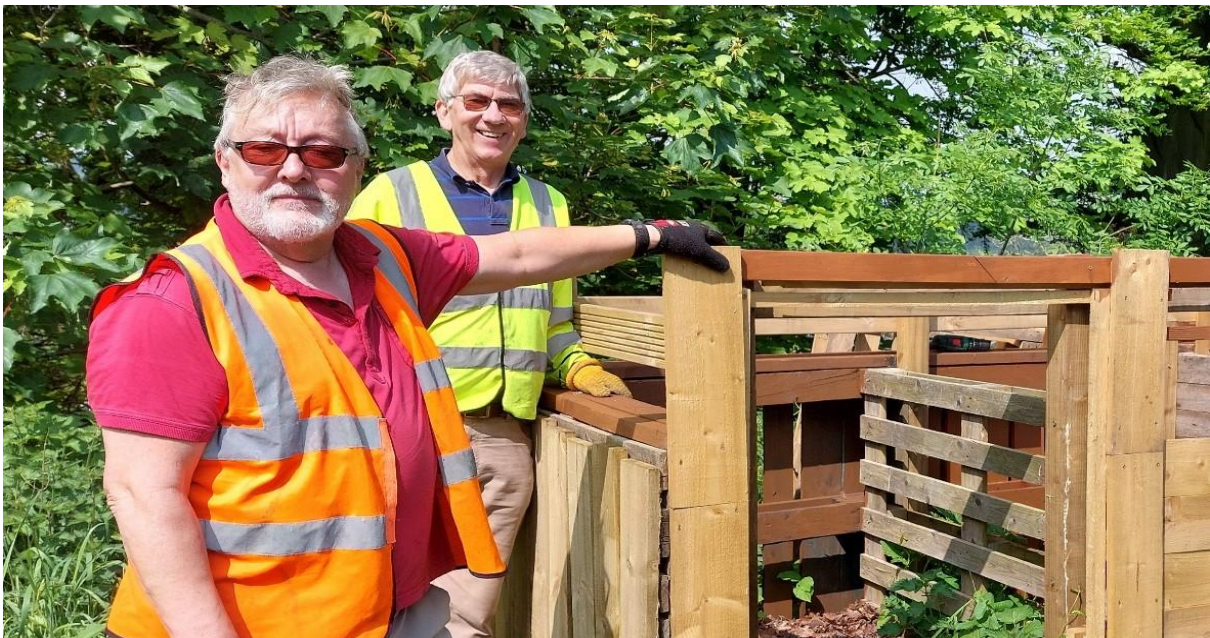
Friends completed work on building the Composting Station in May 2024.