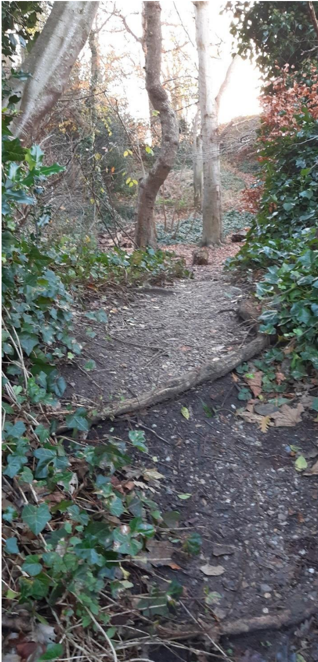
An exposed root on the Perimeter Path was packed around by Friends with material to make it less of a trip hazard: in November 2024)..