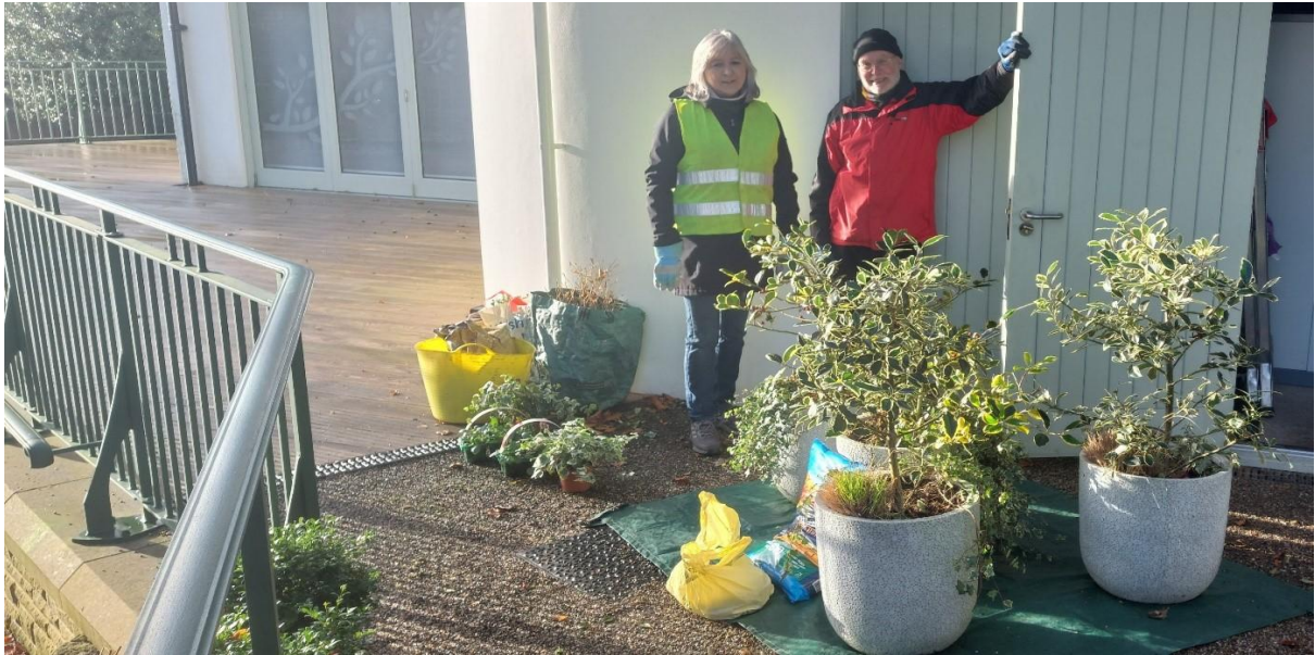
Pot-rejuvenation: adding new ivies and mulch to the established holly-pots on a sunnier November day (in 2024).