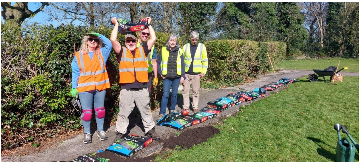
One last bag – the Friends completing the 'big compost-shift' to the Inner Bailey to fill the gutter on the lawn edge (in the Spring of 2025).