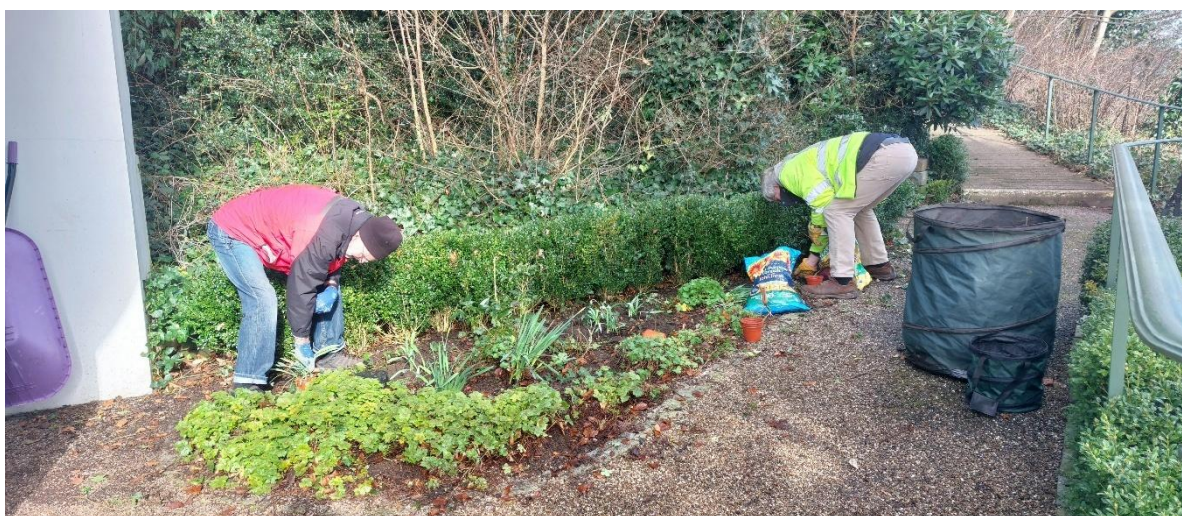
A lighter task: just adding a few bulbs (big snowdrops) to Bed 11 by the Toolstore (MTV 162 / Feb 2025)

During the financial year we secured a good sufficiency of funds for all we needed to do and plan, financially; and, continued to work hard throughout the year on enhancing the Park – through a number of new initiatives and direct actions (large and small).