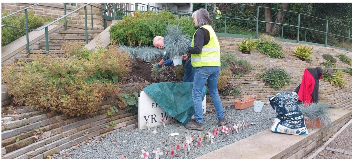
Friends engaged in replacing failed artemisia plants with tougher, blue-grey (grass) plants – to maintain the grey-leaved appearance as designed - in Bed 8, behind the Memorial Stone (in September 2024).