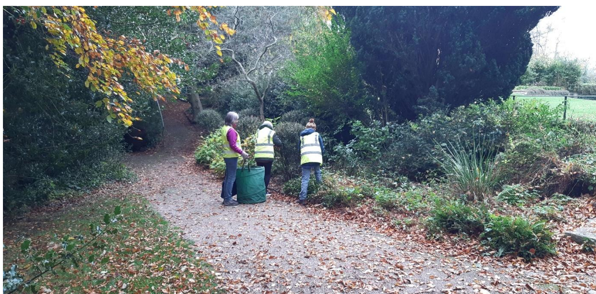
On a damp day (in November 2024) 'the land girls' team cleared leaves out of the main beds on the Inner Bailey