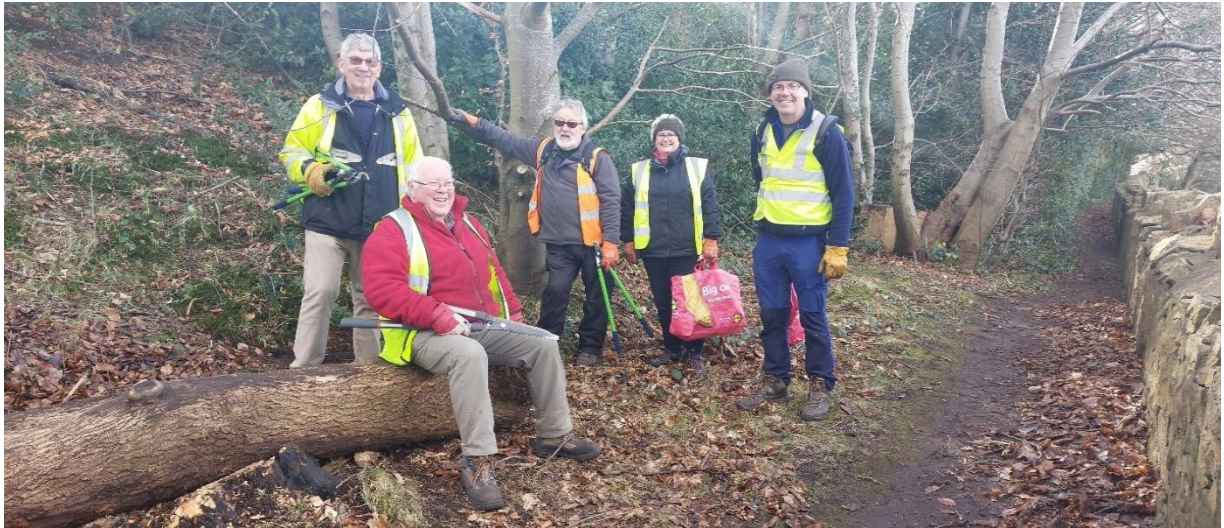
Taking a rest after a vigorous session - thinning self-sown seedling trees in the ecologically-sensitive north-west corner of the Park - at MTV 166 (in February 2025).