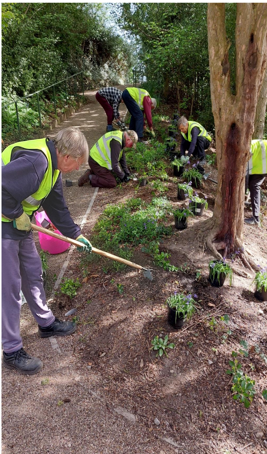
Improving the Beds - Bed 6 is a challenge: at the top end of the shady Bed 6, bluebells and other plants being added in late Spring 2022. More new plants will be needed in the future by Friend (as the original pachysandra planted there by the landscape contractors struggled there for various reasons).