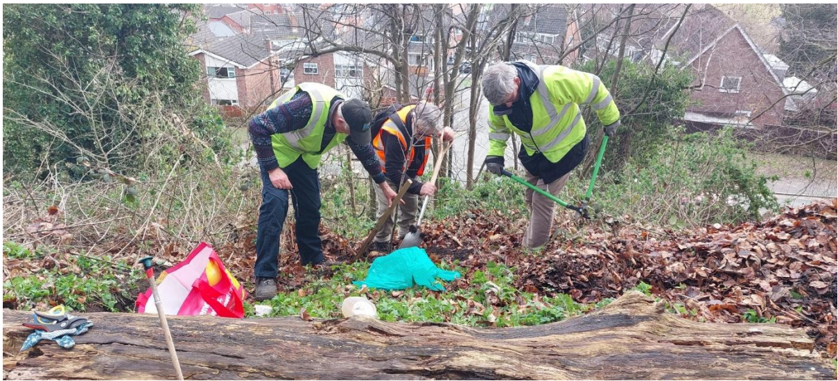
STS 31 (on 18 March 2023) – our big tree planting day in the Park – the 6 th new tree goes into position.