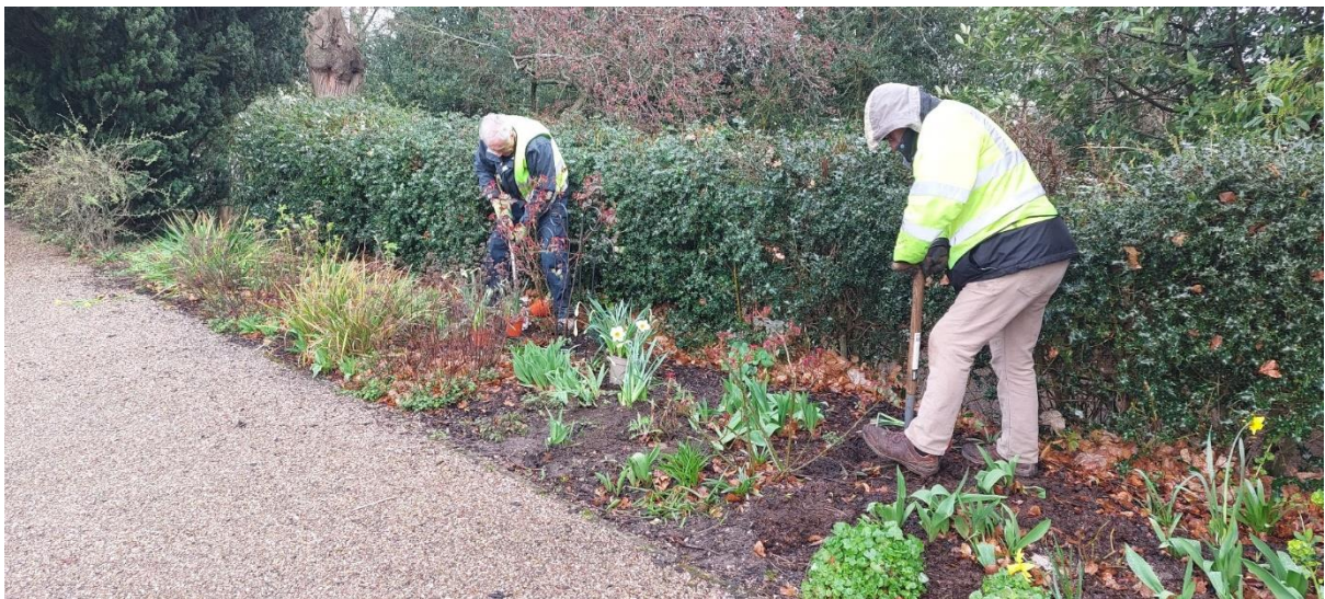
MTV 71 – adding Daffodils (Barrett Browning) to Bed 18 – on a damp day in March 2023.