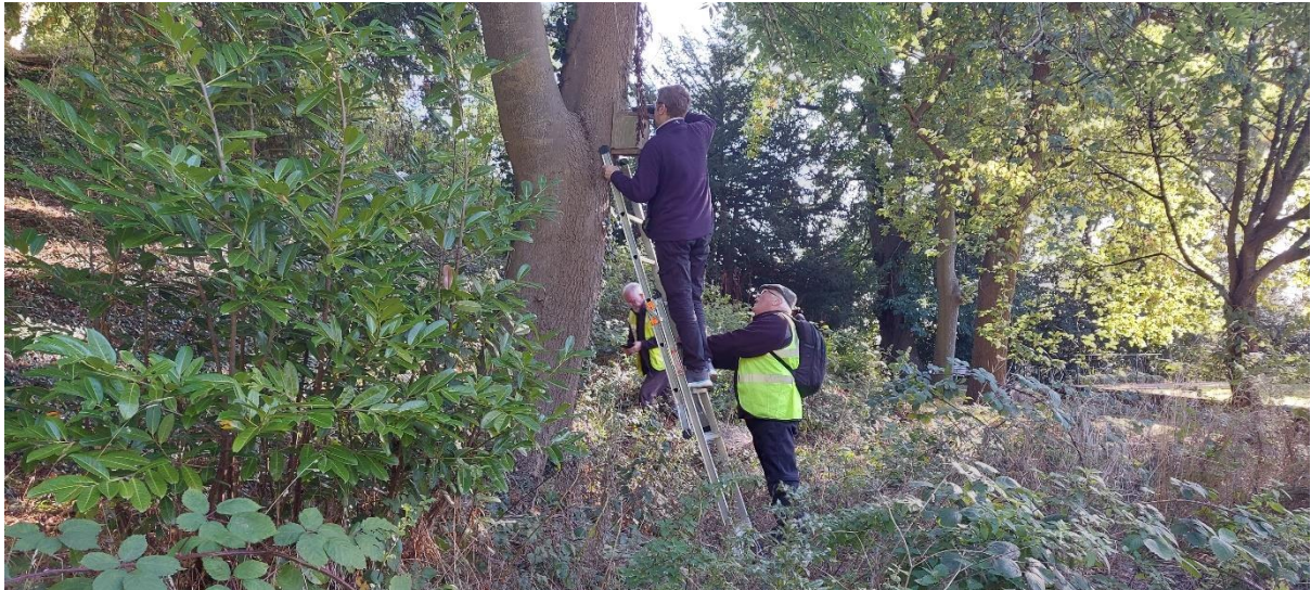
Attending our set of next-boxes (now 25) across the Park in the autumn of 2022.