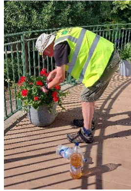
Getting many water bottles ready – to water our pots and other plants during a long summer in 2022.