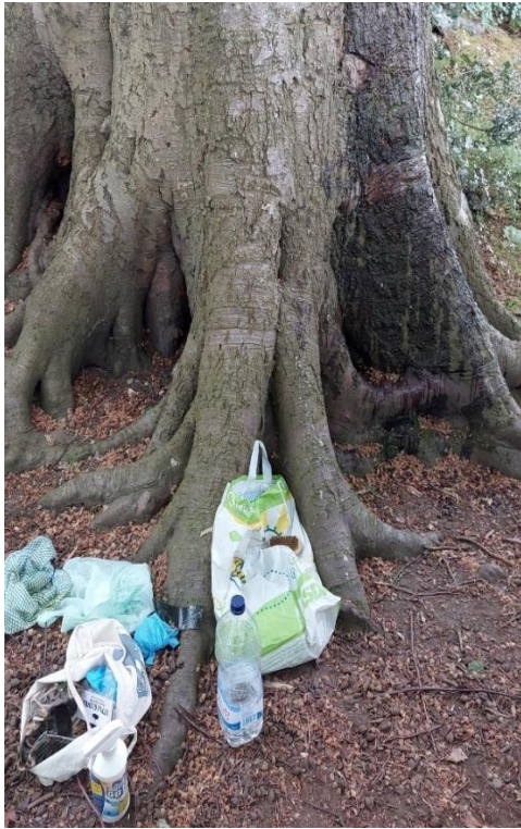
Graffiti removal - from important trees in the Park.