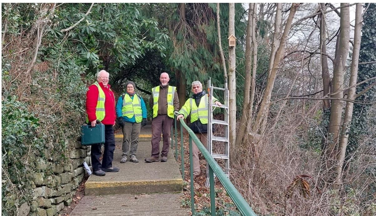
A new BHG&W Volunteer hard at work, with our usual volunteers, at an Extra MTV, adding a butterfly box.