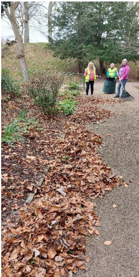
Removing many dead leaves - from the main Beds.