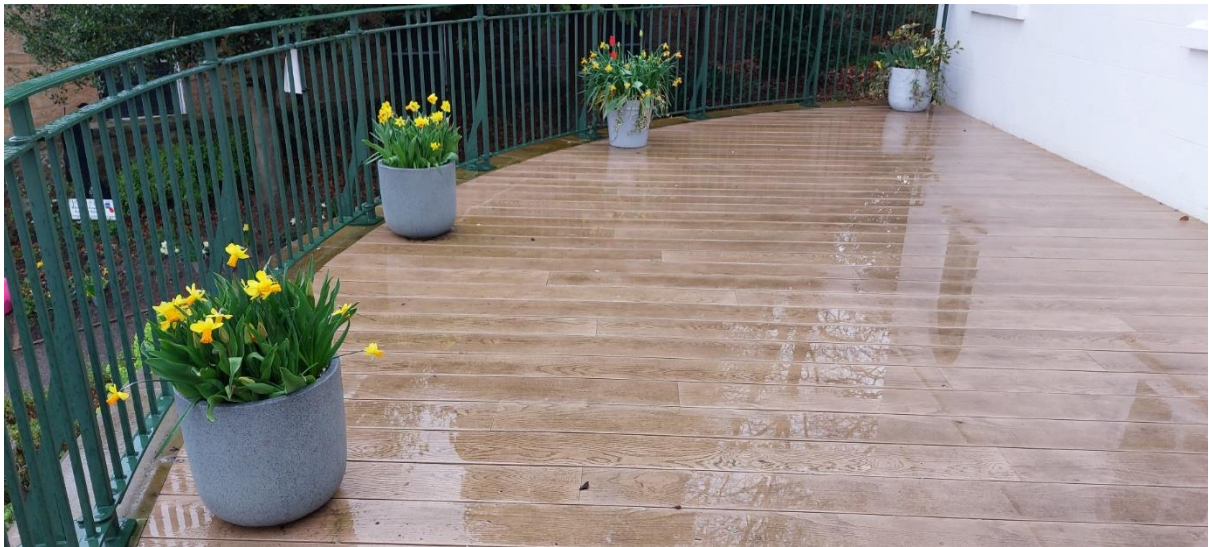
Sorting an immediate danger found during our MTV 70 session – in mid-March 2023