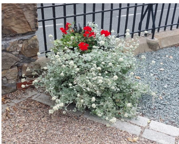
Silver helichrysum and red pelargoniums and black mondo grass: a summer display pot near the War Memorial.

[Front cover image: The Friends busy removing, stage by stage, the overgrown Berberis plant infecting the Irish Yew on the Inner Bailey.]