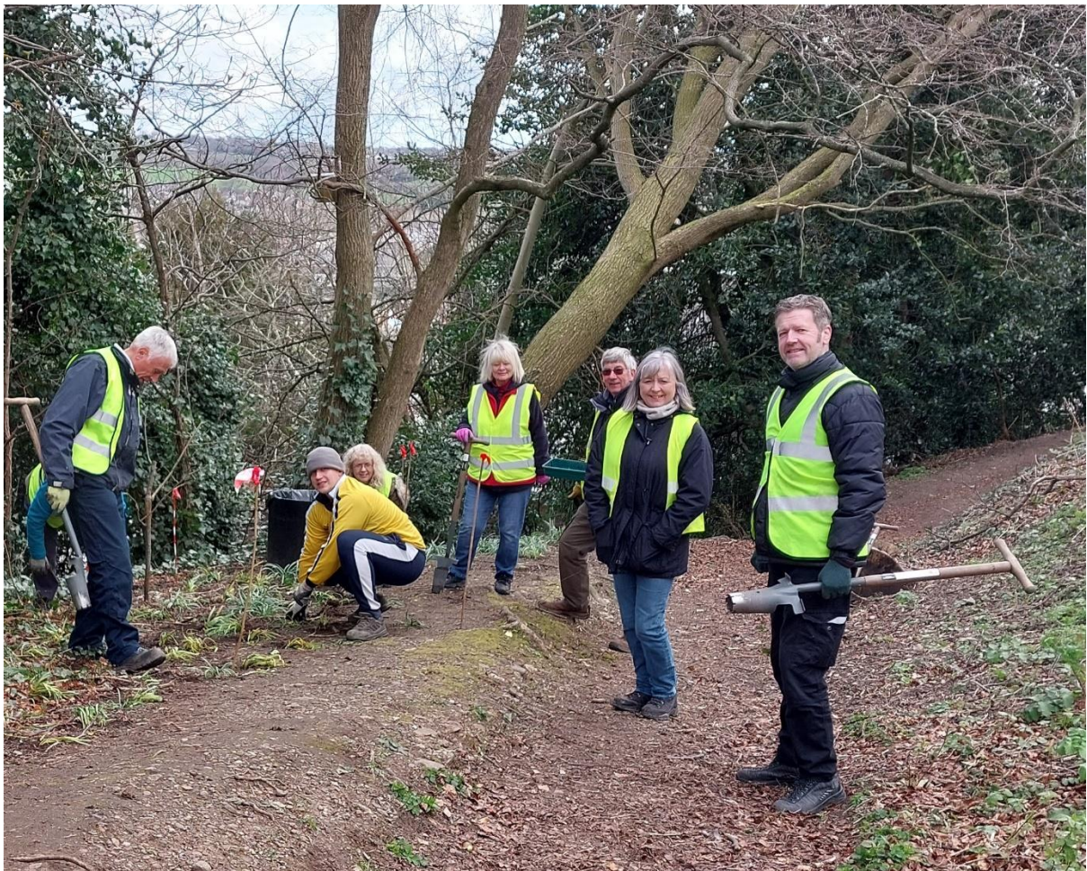
Adding snowdrops to one of our establishing Snowdrop Patches: at the trainees' first practical session.