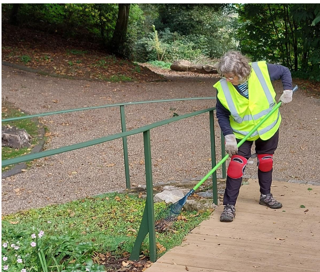
STS 13 - Clearing dead leaves off the sedum patch on the Inner Bailey.