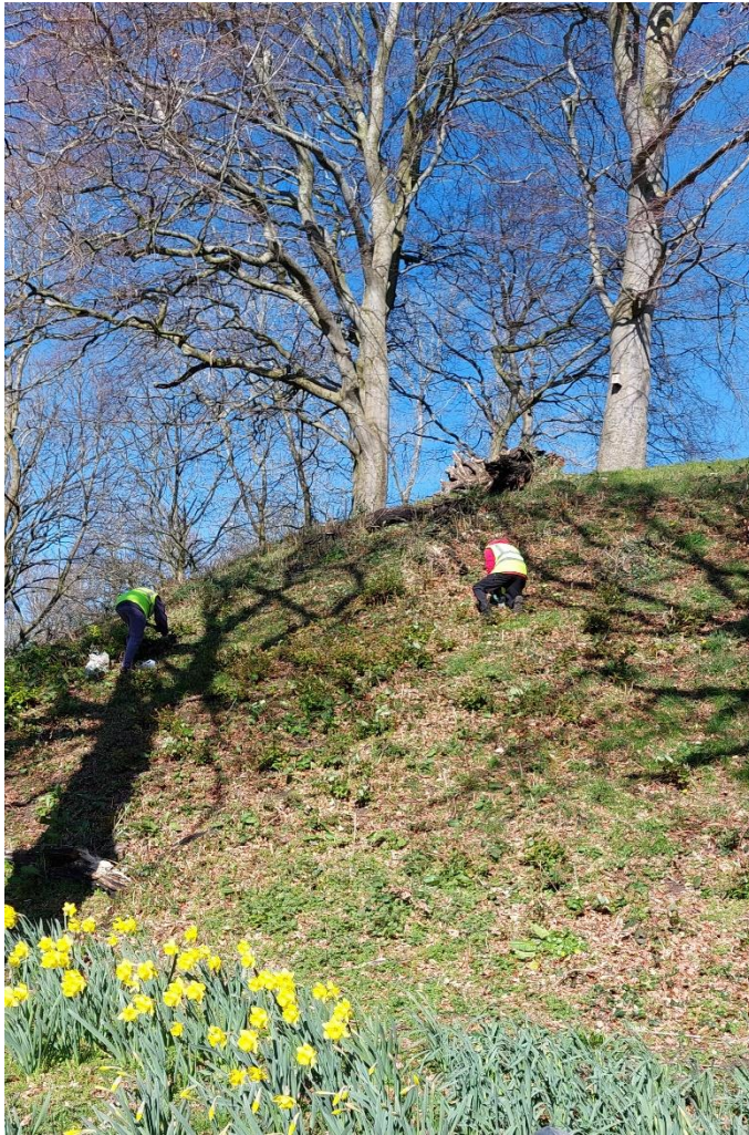
More native primroses were added to the south face of the Motte.