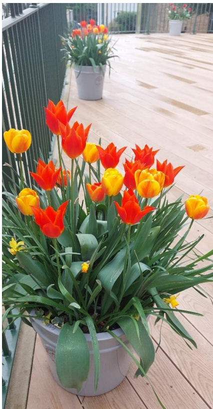
A few of our Outdoor Pots in the Park – prepared off-site in the Winter to display in the Spring of 2022.