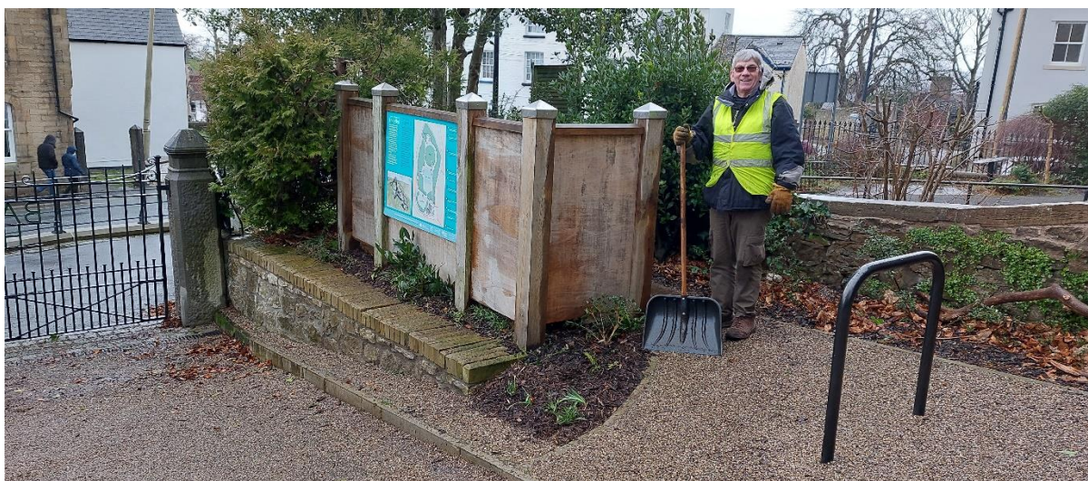
A gravel pile (loose gravel from the new paths) was shovelled into two donated rubble bags, for tidier storage behind the Information Point (until it can be reused somewhere in the Park in due course).