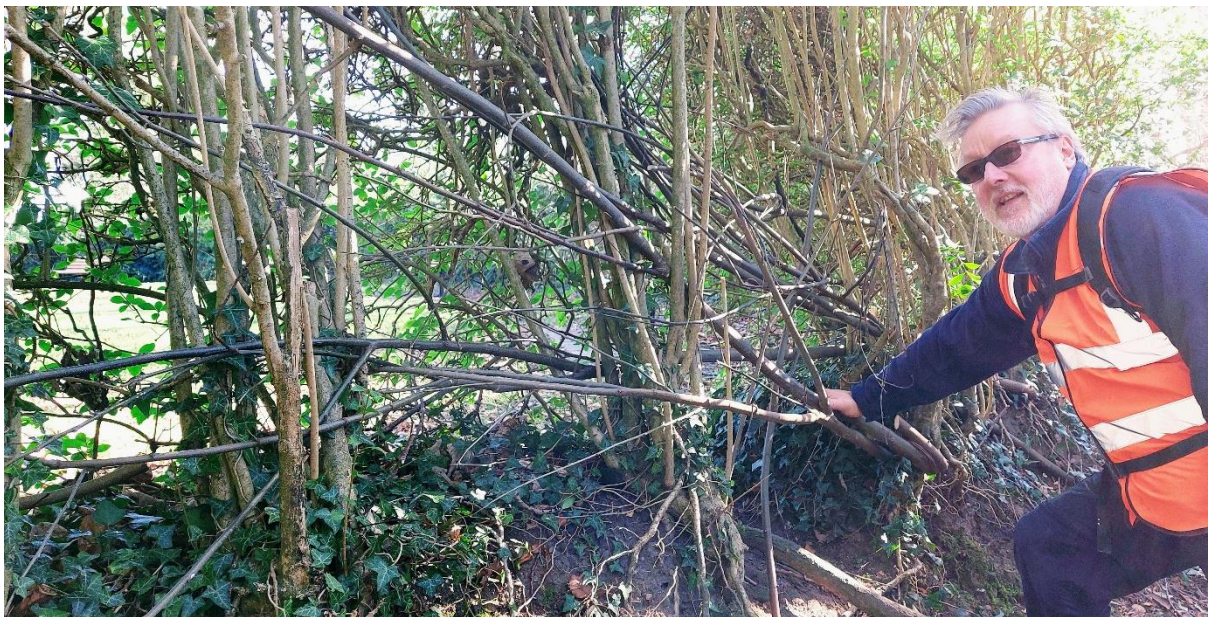
Sweet-chestnut spurs were used to pack a few of the many gaps in the Inner Bailey hedge.