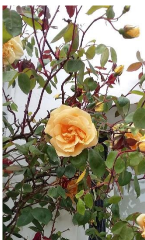
Rose 'Lady Hillingdon' – an old tea rose added to the Friends Bed (Bed18), facing the Inner Bailey.

[Front cover image: The Friends and other volunteers at the Park, celebrating the award of a Keep Wales Tidy 'Green Flag' to the Park, during October 2021.]