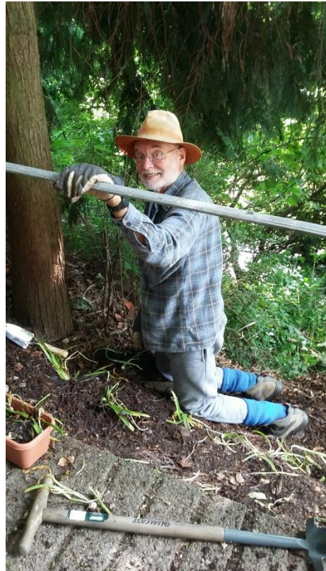
STS 8 - Adding bluebells in a very narrow space alongside the Concrete Rampway: hard work!