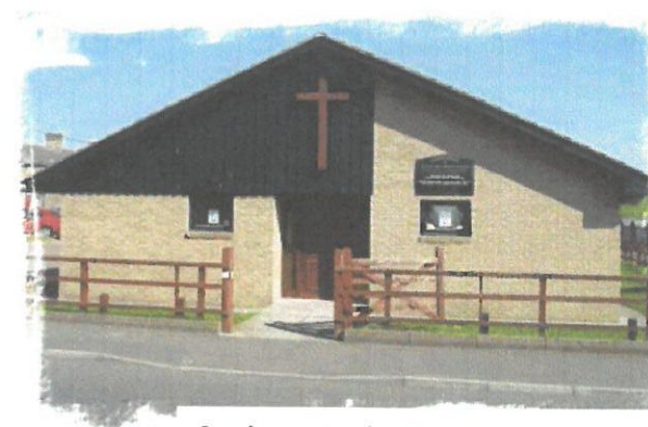
Strathmore Road Methodist Church at Chopwell