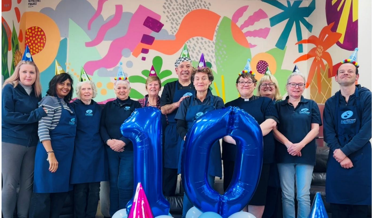
Pathway staff and volunteers celebrating 10 years of Great Yarmouth Pathway!