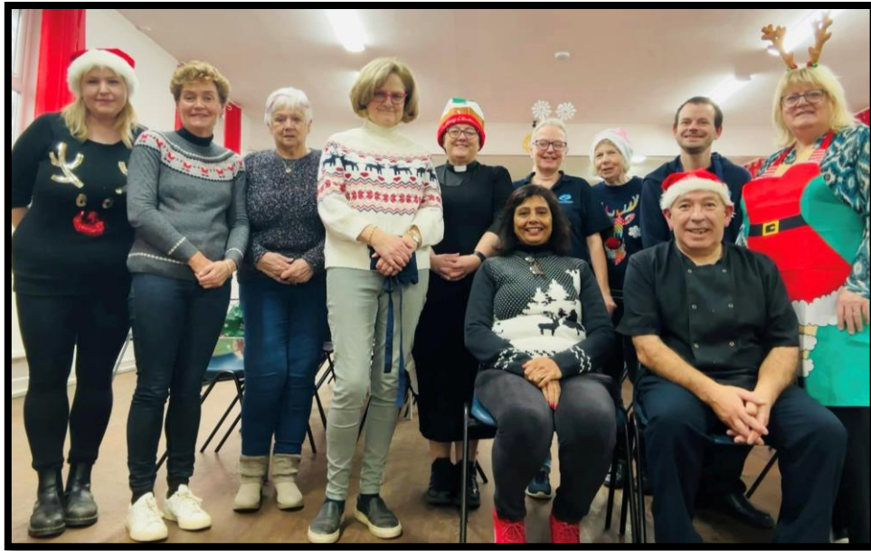
Christmas Lunch staff & volunteers December 2023