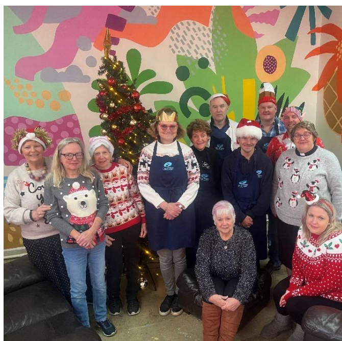
Volunteers & Staff ready for the Christmas lunch

members of staff. One is our community link worker, who works across both the Pathway and St Mary Magdalen Foodbanks and does amazing support and signposting work and is making real differences to people's lives that come to us. We have also employed a Dial Multi-Disciplinary Support Worker, who attends café and foodbank sessions to provide expert advice and support to our clients.