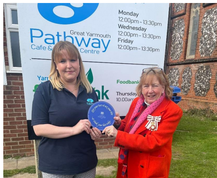
The Lord Lieutenant of Norfolk presents a plaque acknowledging the commitment of Pathway during the Covid Pandemic