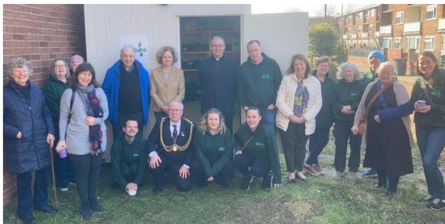
Opening of the new Foodbank by the Mayor of Great Yarmouth, March 2022