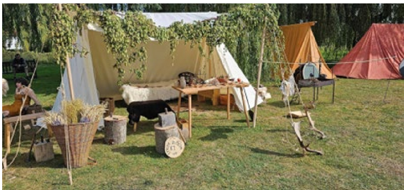
Encampment on the Quay Green