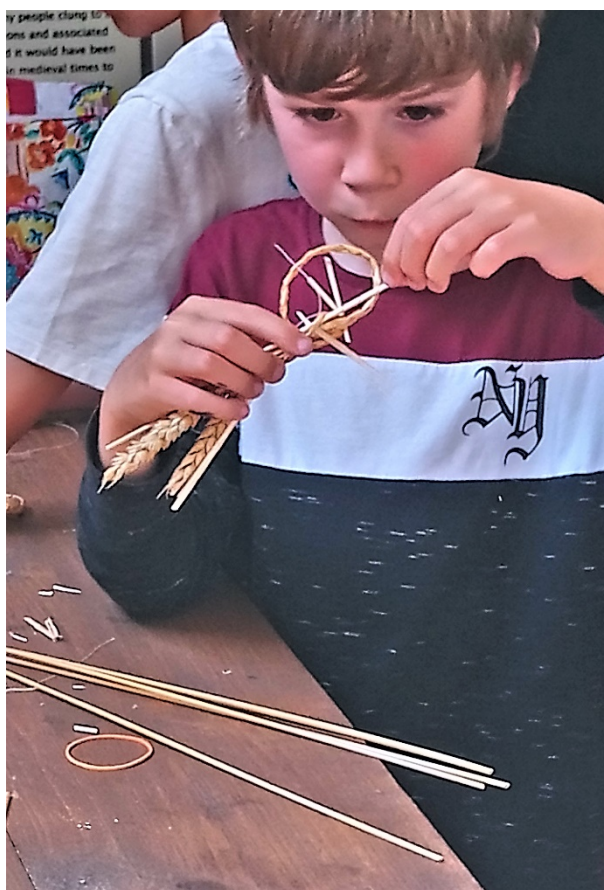
Children's Corn Dolly Workshop

Discussions with English Heritage are ongoing regarding group visits to the Centre for their Members' Days Out.