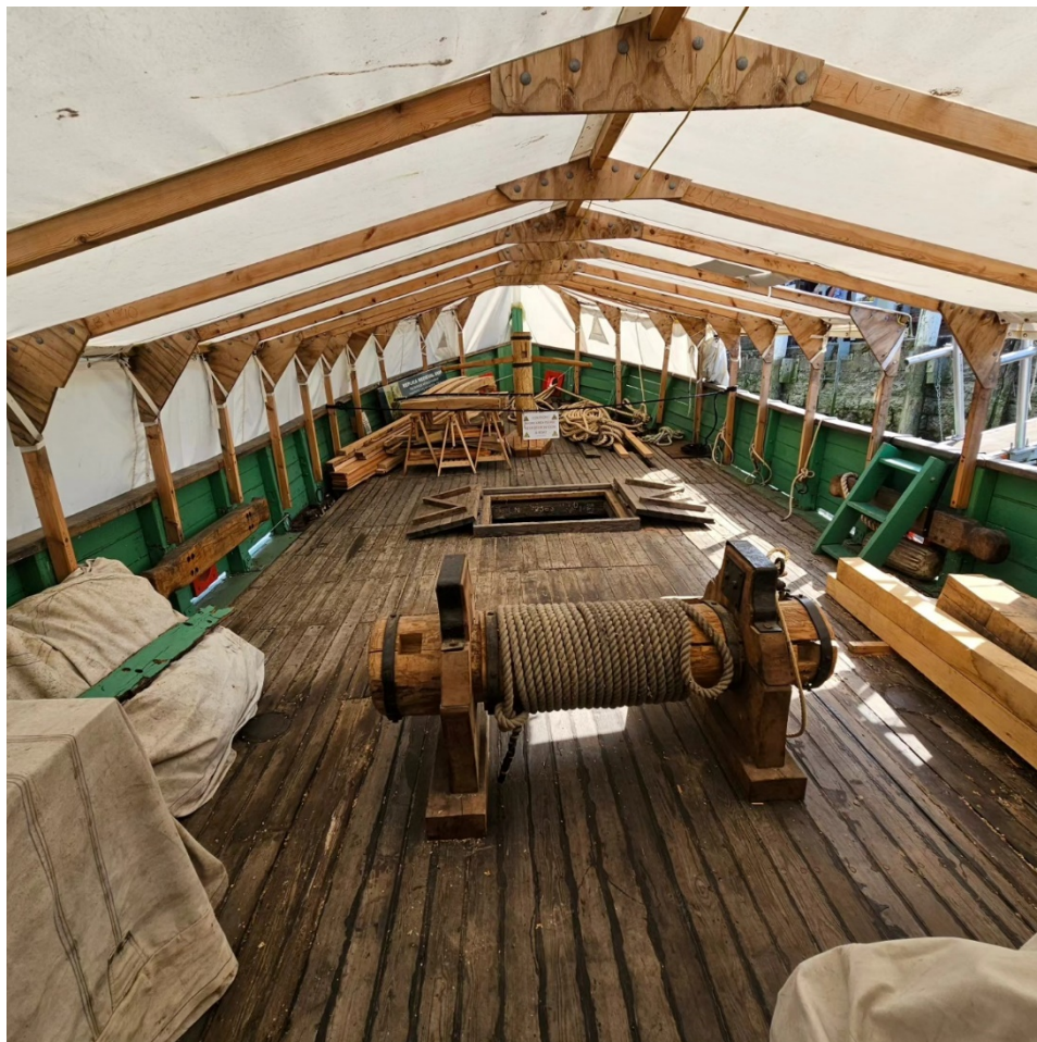
Windlass and Capstan Installed

Our aim from next year onwards will be to fabricate the fore and stern castles in the workshop and install them on the hull before moving on to erect a mast, install a sail and rigging and, in time, modify the internal hull area to allow visitors to sample medieval life below deck. To this end, early in 2024 we will be taking the Nicholas to a dry dock for a month so we can complete the repairs to the deck and hull in an efficient and orderly way.