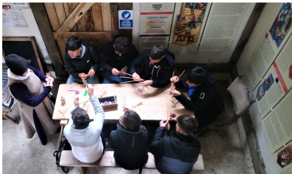
Wheat Weaving Class

Have-a-go crafts including Calligraphy, Wheat Weaving and Egg Tempera painting ran very well during the Sandwich Festival weekend in August, with many children and adults alike enjoying themselves whilst gaining interest in the workshops offered at the Centre. The calligraphy tables were full both days with all ages, including those who had never tried but always wanted to. Others who had enjoyed this craft as a child were delighted to have another opportunity.