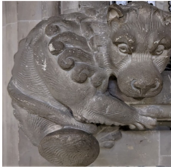
Stone carved gargoyle

In early June we hosted the brilliant Cats Eye Carving for two weeks as part of Southeast Open Studios. The stone carver set up a stone carving workshop in the Centre giving visitors the chance to see and even have a go at the ancient craft of stone carving.