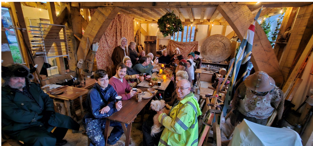
Volunteers celebrating in the Centre