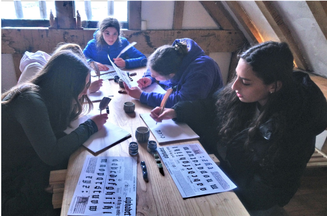
Calligraphy Using Quills

Quills were used to try and practice a medieval book hand and the work of the scribes of the time were explained with examples and material reproductions. Mainly children tried their hand at some egg tempera painting onto woodcut prints which depicted scenes of the seasons. Visitors were very excited to complete a corn dolly with the Wheat Weaver, who patiently led them through the various stages of weaving wheat.