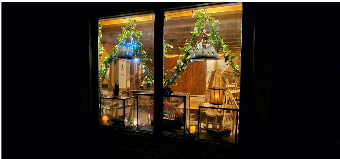
Christmas Advent Window

Finally in December, to finish off the year, we always love taking part in the Sandwich Advent Window event. We enjoyed a mini craft market, hot cup of wassail and festive cooking demonstrations along with a medieval Christmas window display.