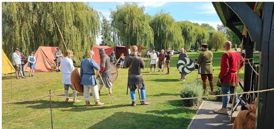
Medieval activities on the Quay Green

Our biggest event so far was held on 10th & 11th June as part of the town-wide Le Weekend event. The Quay Green was transformed into the biggest medieval tented camp Sandwich has seen for a long time (see front cover ). Over 100 reenactors from eight different groups set up over fifty tents for the weekend providing living history, cookery and combat demonstrations along with crafts, have-a-go archery and axe throwing, games, music and dance, puppet theatre and not forgetting a very well-stocked tavern!