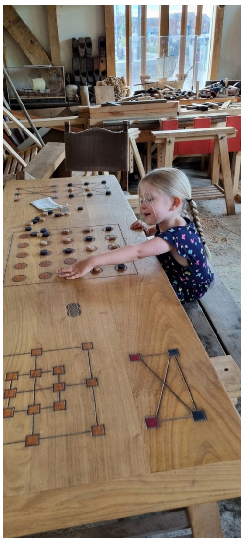
The popular medieval gaming table