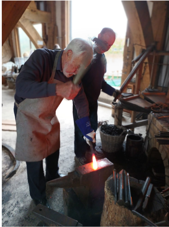
Blacksmithing in the Centre's forge

Finally in December, to finish off the year, we always love taking part in the Sandwich Advent Window event. We enjoyed a mini craft market, hot cup of wassail and festive cooking demonstrations along with a medieval Christmas window display.