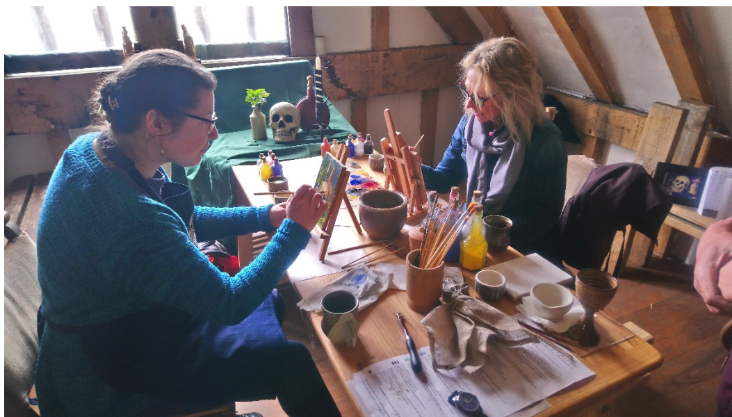
Egg tempera painting class

Workshops took place throughout the year including Blacksmithing, Baking, Bookbinding, Calligraphy, Illumination, Wheat Weaving, Circular Netting, Mead Making and Tablet Weaving. There still remains a lot of interest for workshops for future dates. We hope to add Fletching to the range of workshops in the future.