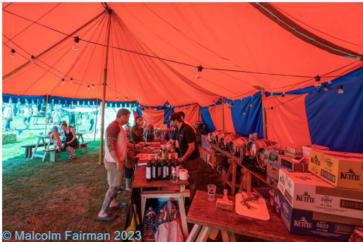
The well-stocked tavern is a popular venue at weekend events