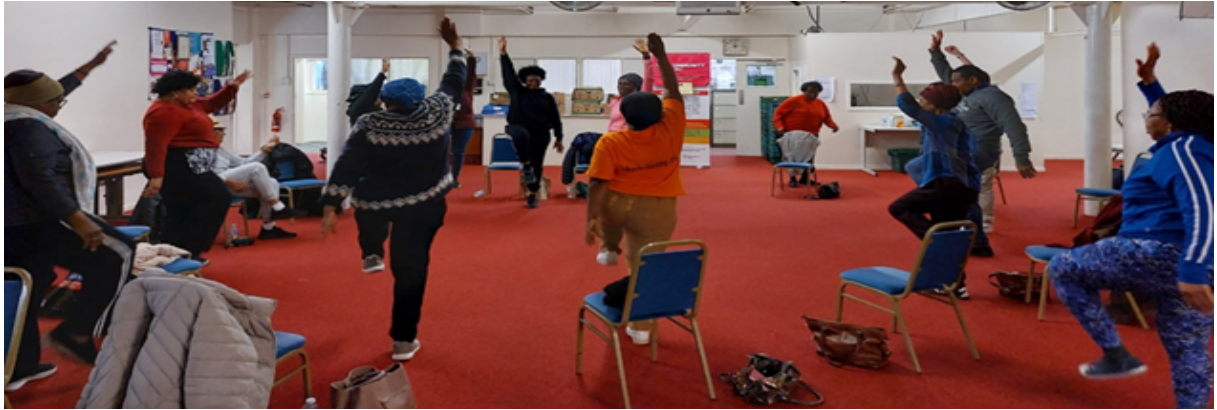
Weekly session at Transformation Community Resource Centre

and we were able to focus on capacity building to ensure that the service could be sustained over the longer term.