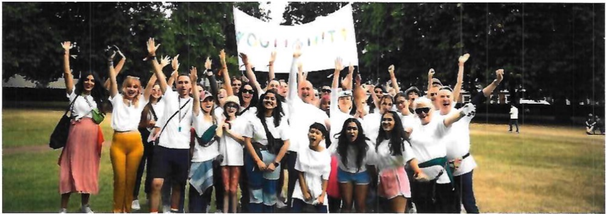
Youmanity volunteers joining London Pride