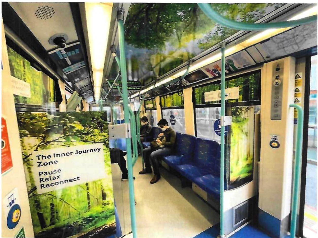
The worlds' first mindfulness train on the DLR network

To mark World Mental Health Day Youmanity celebrated the world's first mindfulness train carriages. This was the result of a close cooperation between KeolisAmey Docklands (KAD), operators of Docklands Light Railway (DLR) and Youmanity which saw the deployment of the 'Inner Journey' passenger trains to support passenger wellbeing and mental health. This project was supported by Brain Recharge - a self-guided meditation app developed for use on DLR trains and designated relaxation areas located in Canary Wharf, Tower Gateway, Woolwich Arsenal DLR stations.