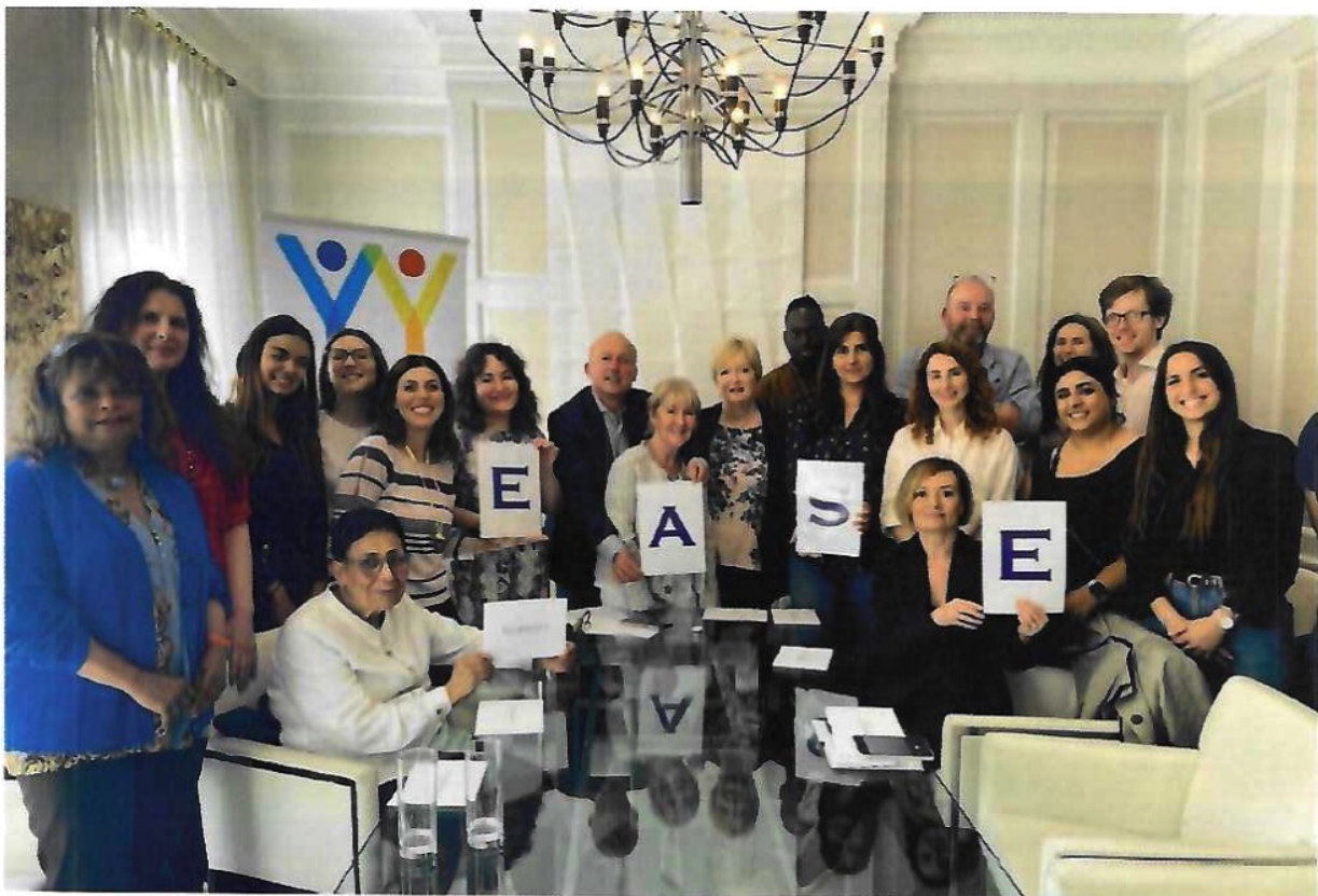
Project presentation of the EASE Project in London on 07/06/2022

Directed to women, the project assumed that women who owned a business already contributed to the global economy and that there is no talent shortage among female entrepreneurs. EASE followed a Sustainable Development Goals call for ending poverty, addressing global inequalities and "leaving no one behind by supporting vulnerable groups, achieving gender equality and empowering women and girls".