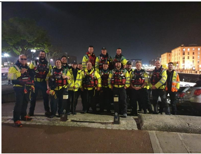
Eurovision Final Night