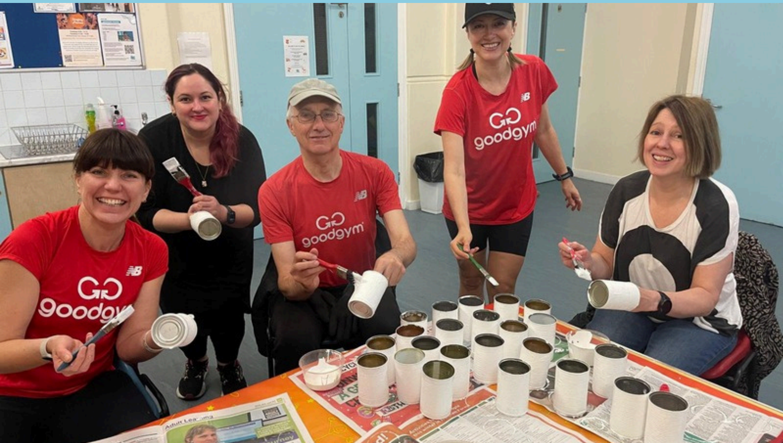
Good Gym volunteers painting tin cans in preparation for the Easter fundraising trail in Langthorne Park

We continue to offer volunteering opportunities to the local community and students. This year we worked with 32 students through the Waltham Forest Business Education Partnership, Leyton Sixth Form College, Waltham Forest College, Leytonstone School, Walthamstow School for Girls, Trinity Catholic School and George Monoux Sixth Form.