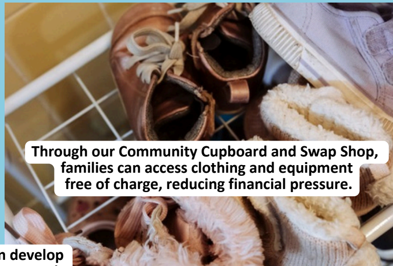
Through our Community Cupboard and Swap Shop, families can access clothing and equipment free of charge, reducing financial pressure.