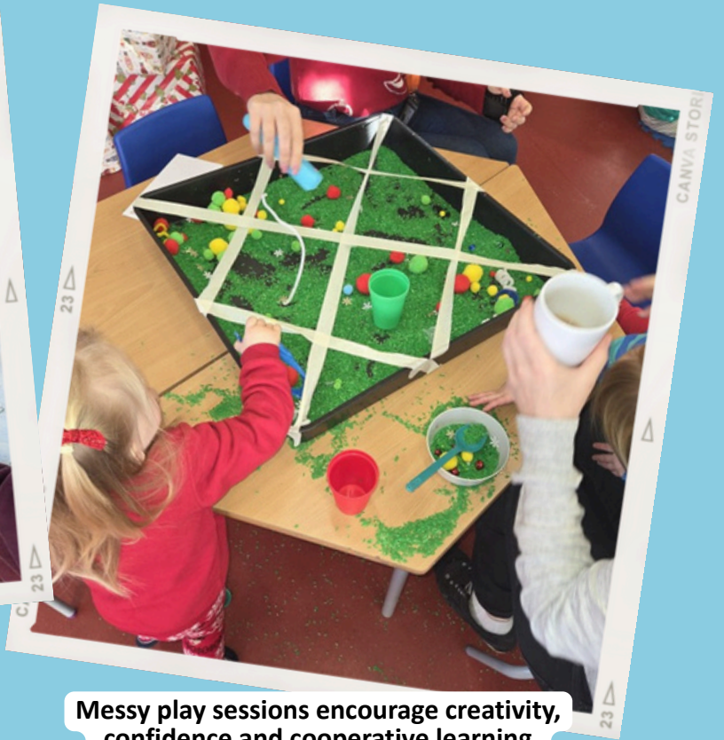
Messy play sessions encourage creativity, confidence and cooperative learning.

Our 90-minute play sessions cater for children aged 0-5 and are led by trained staff. Children benefit from interactions with a wider age range than they are often exposed to in other early years settings, such as nursery. It also means that parents can bring younger siblings and childminders the full range of children they care for. Sessions are based around different themes and stories each month. Staff have developed a successful structure which includes: