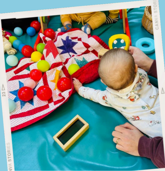
Sensory play support early development and bonding between babies and their carers.