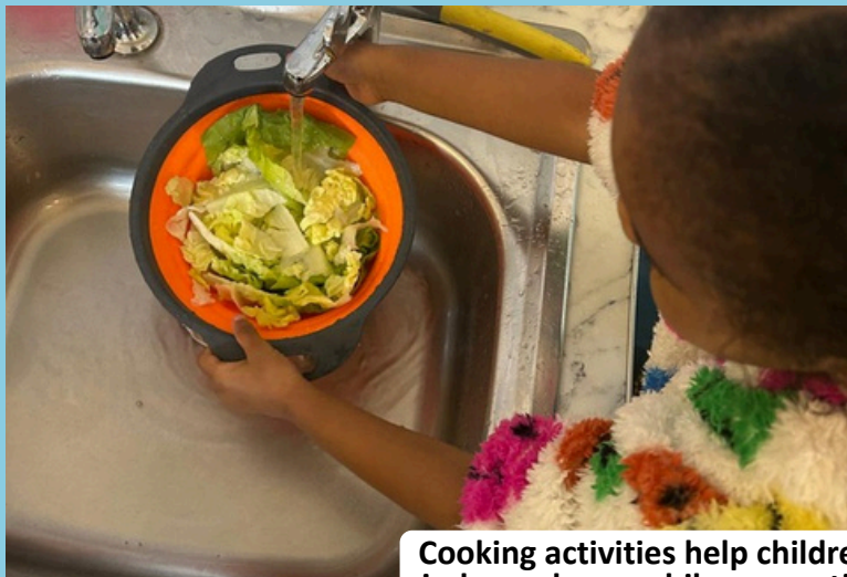
Cooking activities help children develop independence while supporting parents with ideas for home.

"This is the best stay and play that I have attended because of the culture of the staff. The staff are very present for the adults and understand the importance of looking after the carers of the children." (Parent)