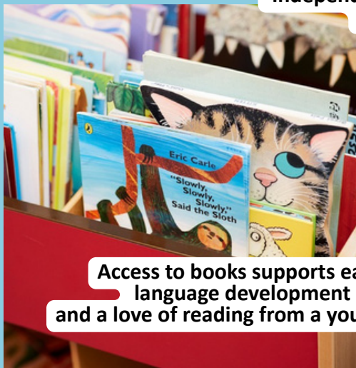
Access to books supports early language development and a love of reading from a young age.