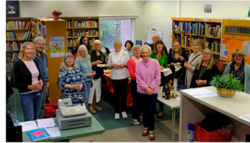
Whickham Volunteer Library Association - Volunteer staff celebrating seven years since opening