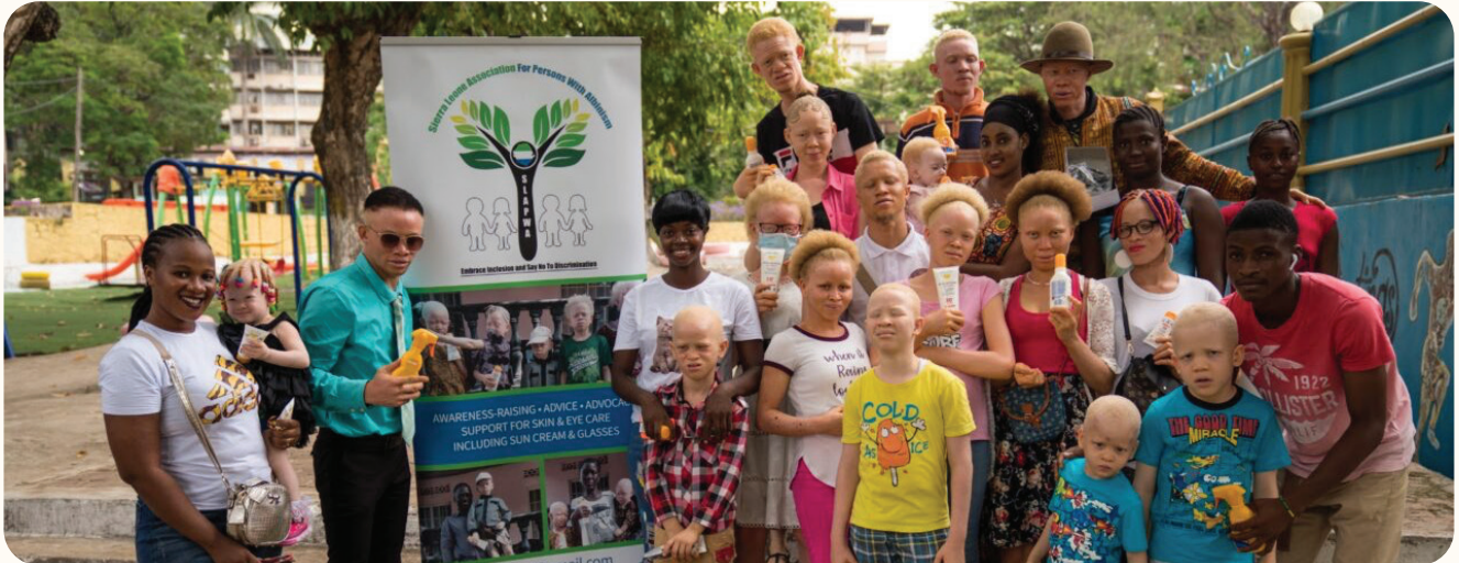
Protective sunscreen reduces skin cancer and saves lives.

We work internationally with Disabled People's Organisations and NGOs to promote the rights of people with disabilities, supporting practical initiatives (eg transport, essential medication, university fees) whilst also supporting strategic work which can lead to transformative change.