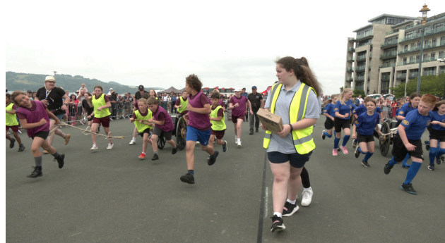
Meon B - Portsmouth