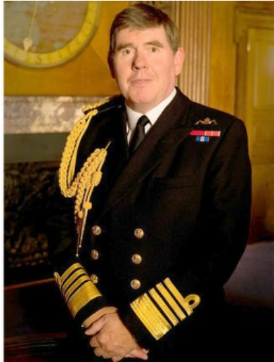
Admiral Sir Mark Stanhope GCB,OBE,DL

Promoted to full Admiral in July 2004, Sir Mark served in NATO as the Commander in Chief Fleet before becoming the First Sea Lord and Chief of Naval Staff in July 2009. He retired in April 2013 and now has many charitable interests