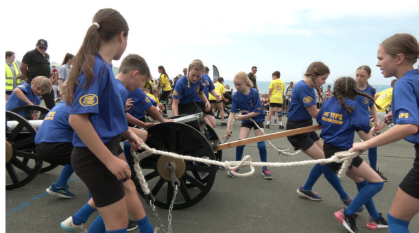
Yealmpstone Farm Port