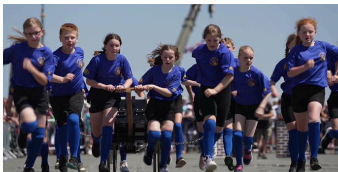
Yealmpstone Farm Starboard