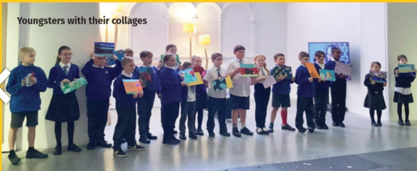
Youngsters with their collages