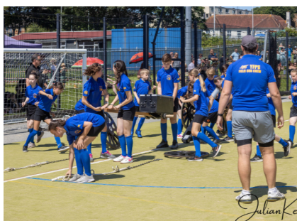
Yealmstone Farm Primary