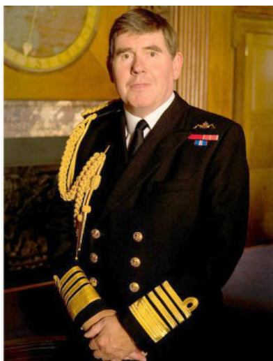
Admiral Sir Mark Stanhope GCB,OBE,DL

Promoted to full Admiral in July 2004, Sir Mark served in NATO as the Commander in Chief Fleet before becoming the First Sea Lord and Chief of Naval Staff in July 2009. He retired in April 2013 and now has many charitable interests