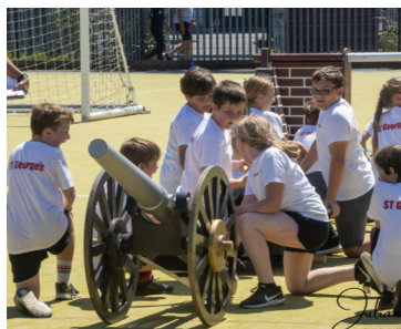
St. George's Primary