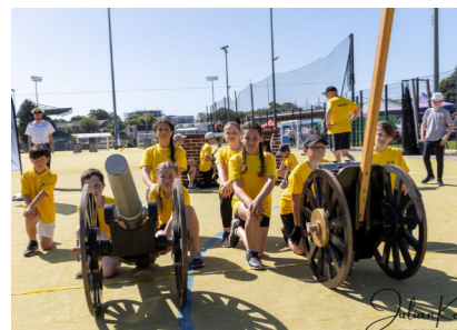
Widey Court Primary