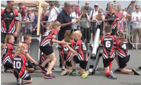
Burraton Community Primary School