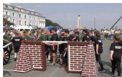
Carbeile and Pennycross shaking hands after an epic contest during the last run.