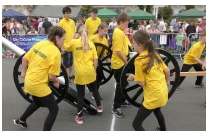
Widely Court Primary School