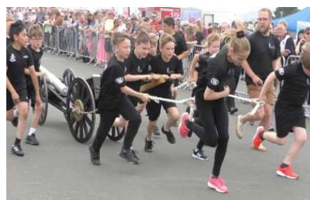
Pennycross Primary School Record holders