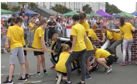
Ernesettle Community School