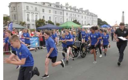
Widewell Primary School