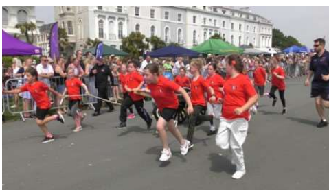
Shakespeare Primary School