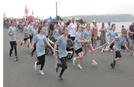
Brunel Primary Academy