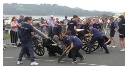
Victoria Road Primary School