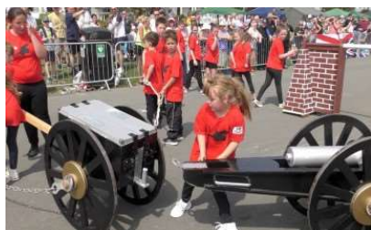
Weston Mill Primary School