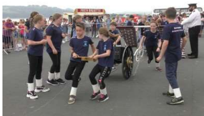
Boringdon Primary School