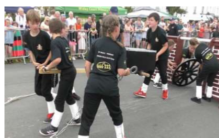
St Paul's Roman Catholic Primary School