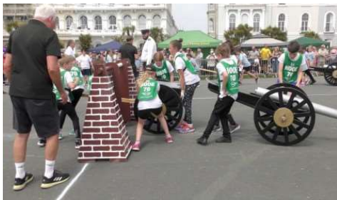
Hooe Primary School