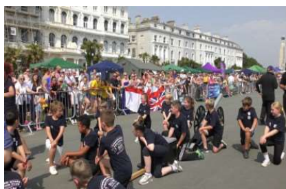
Stowford Primary School (Stowford Stars)