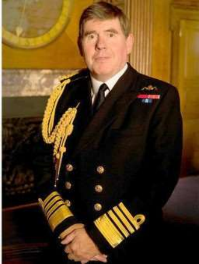
Admiral Sir Mark Stanhope GCB,OBE,DL

Promoted to full Admiral in July 2004, Sir Mark served in NATO as the Commander in Chief Fleet before becoming the First Sea Lord and Chief of Naval Staff in July 2009. He retired in April 2013 and now has many charitable interests