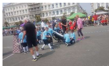
Marine Academy Primary