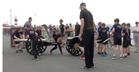
Stowford Primary School (Stowford Supernovas)