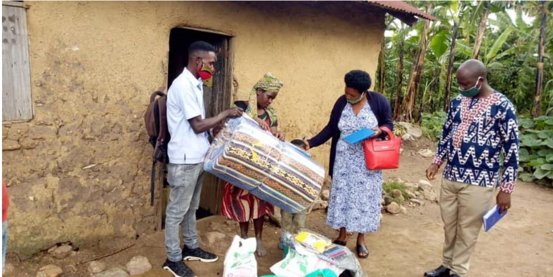
A four year old boy and his grandmother are being gifted a hamper from the Hundred Hamper Appeal. The photo also includes Biojemss staff, the local probation officer, and the local community officer.

The child in the picture above, hidden by the mattress in this photo to conceal his identity, is four years old. At the time this photo was taken, both his birth parents were in prison awaiting trial for the murder of his half-sibling. It was believed that the child was murdered as part of a child sacrifice ritual.