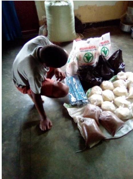
Biojemmss member excitedly looks through the “first fruits” from the Biojemmss land harvest

This has been the third year of registration for The Biojemmss Organisation, UK after being granted UK charity status on the 19 th March 2018.