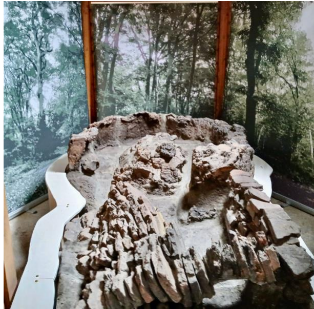
Home after 56 years

The new exhibition of the kiln was ceremonially opened by our patron Hugh Dennis.