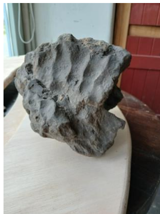
A Roman potter's fingermarks