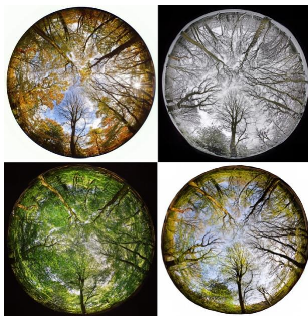
Seasons in Highgate Wood

Meanwhile, Michaela Wright has developed the project's presence on social media, reaching 2,800 accounts on Instagram in September 2024 with the return of the kiln and the construction and firing of the replica kiln. And we heard early in 2025 that the project is now scheduled as a Ceramic World Destination on the map of the Museum of Ceramic Art 'A Virtual Platform Celebrating Clay', based in New York.