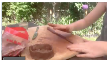
Home potting in Clay Club 2

In response to the limitations of lockdown Charlie Andrew developed and trialled a small-scale online version of the Clay Club (Clay Club 2). Clay was delivered to the home of participating students. They then learned how to make pots as they followed an online course at home. The programme won high praise in evaluations.