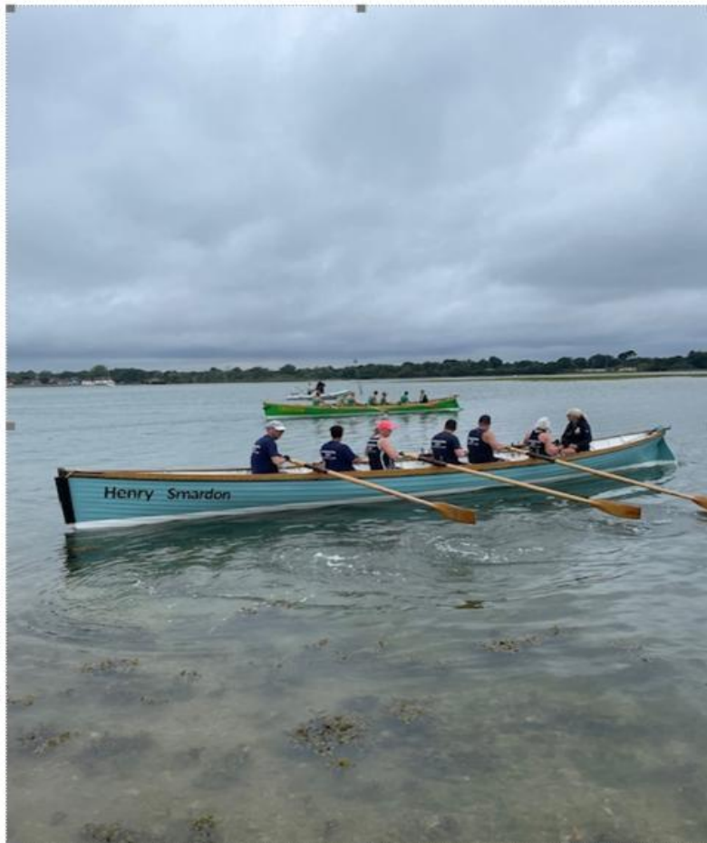
NGRC's latest acquisition wooden gig Henry Sardon, Langstone Regatta, July 2024

NGRC, The Sidings, Railway Approach, Newhaven, BN9 0DF Email admin@ngrc.co.uk