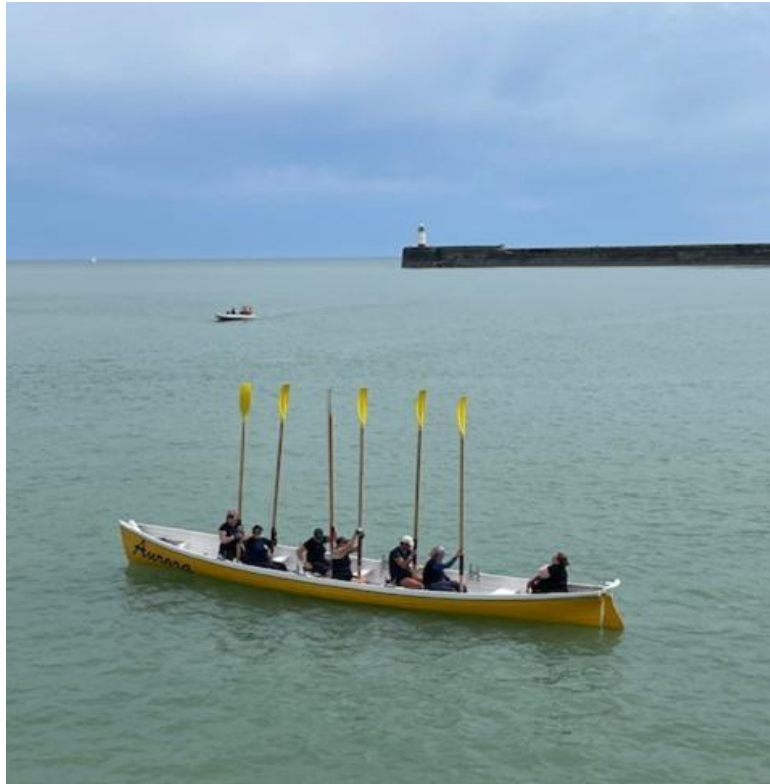
Aurora, Seaford Bay, June 2024

NGRC, The Sidings, Railway Approach, Newhaven, BN9 0DF Email admin@ngrc.co.uk