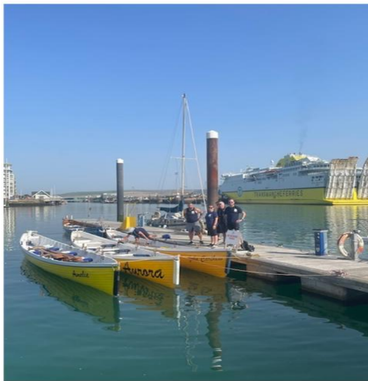
NGRC's wooden gig Amelie, alongside her GRP sisters Aurora and John Carthew