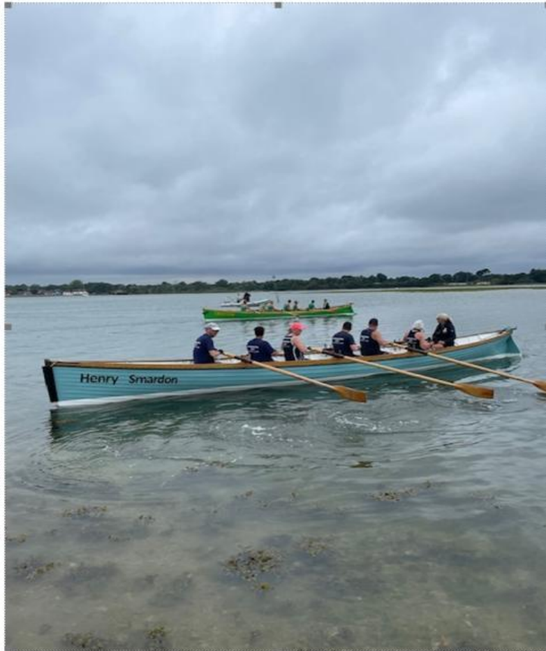
NGRC's latest acquisition wooden gig Henry Sardon, Langstone Regatta, July 2024

NGRC, The Sidings, Railway Approach, Newhaven, BN9 0DF Email admin@ngrc.co.uk