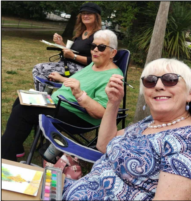
Art Painting In The Community

These larger events create a sense of belonging and connectivity, while also offering volunteering opportunities. Our activities help raise aspirations by providing residents with opportunities to develop new skills, access training, build confidence, and enhance employability.