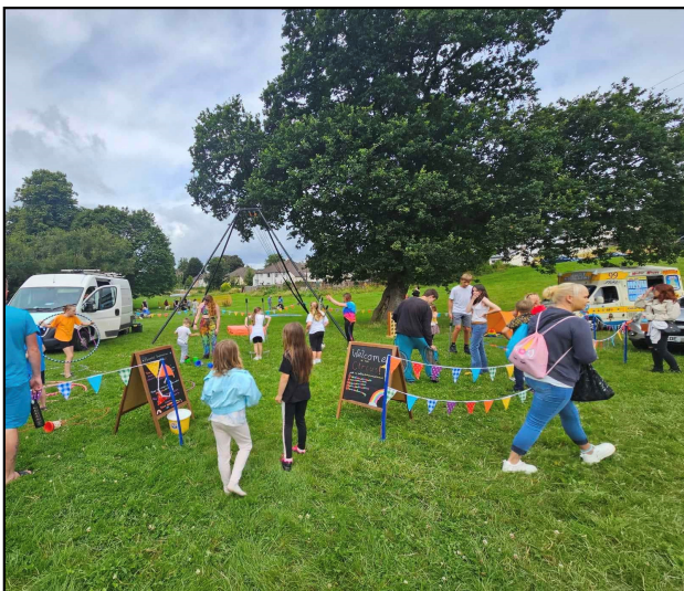
Play In The Park 2024