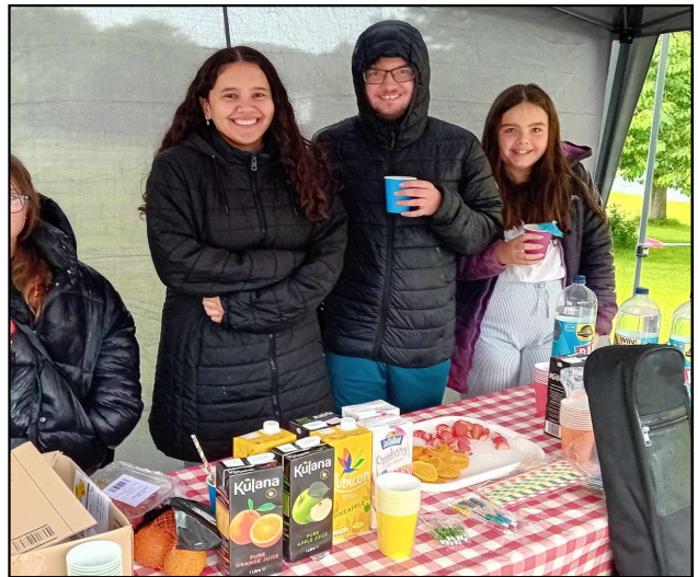
Youth Pop Up

Further to this mentoring and support were provided through Footwork Trust's People and Place programme.