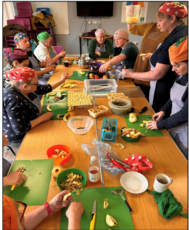
Cooking With Allotment Food

Promote social inclusion and prevent isolation. For the purposes of this clause, "socially excluded" means being excluded from society, or parts of society, due to one or more of the following factors: unemployment; financial hardship; youth or old age; ill health (physical or mental); substance abuse or dependency, including alcohol and drugs; discrimination on the grounds of sex, race, disability, ethnic origin, religion, belief, creed, sexual orientation, or gender reassignment; poor education or skills attainment; relationship or family breakdown; poor housing (i.e., housing that does not meet basic habitable standards); or crime (either as a victim of crime or as an offender seeking rehabilitation into society).