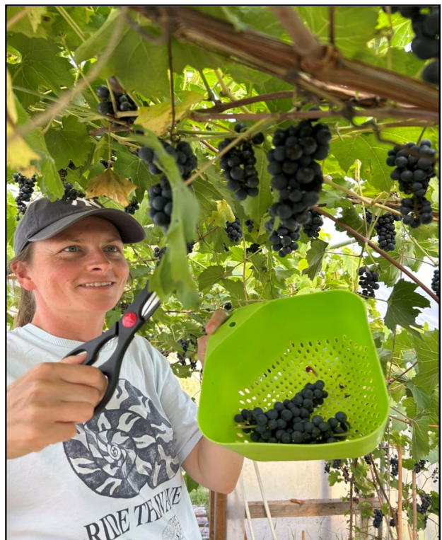
Allotment Image 2025

This year, we delivered four large events, including Play in the Park, The Big Lunch, and the Lantern Project, as well as several trips away. The supportive networks fostered through our work enable residents to naturally find ways to support one another.