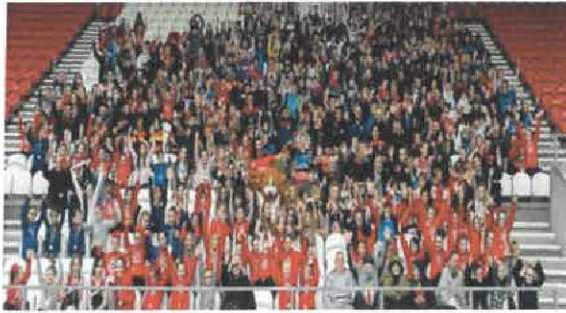
School from St Helens attending first team open training session at TW Stadium