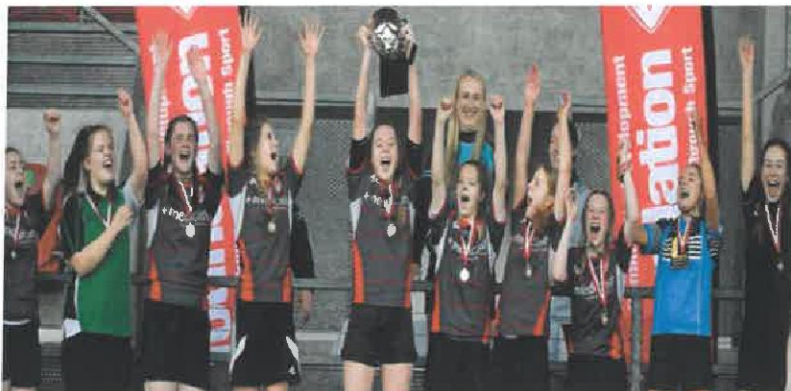
Winners of one of the girls St Helens Schools Cup Final