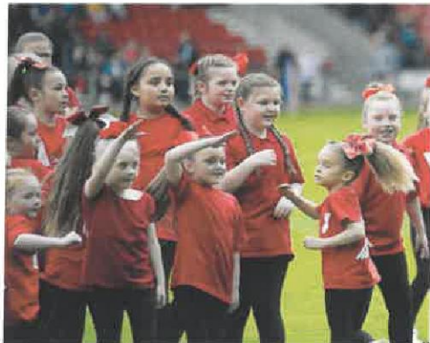
Our Junior Angels performing on a match day.