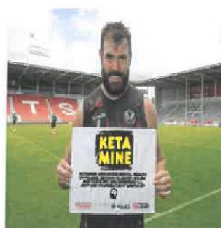
Ketamine Awareness with the first team squad and St Helens Council