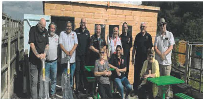
The Volunteers for the Allotment enjoying a well earned break.

Council, The Friends of St Helens Cemetery and of course the Covenant fund.