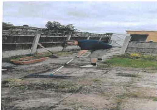
Clearing the pathways Erecting and clearing out the Polly Tunnel