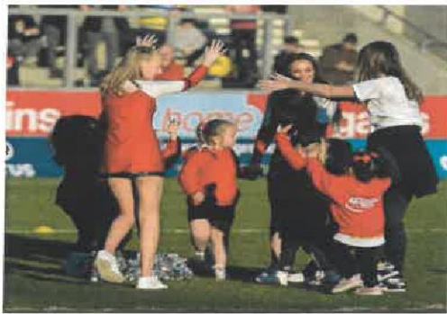
Match day with some of our A-star Angels dancing with mini angels