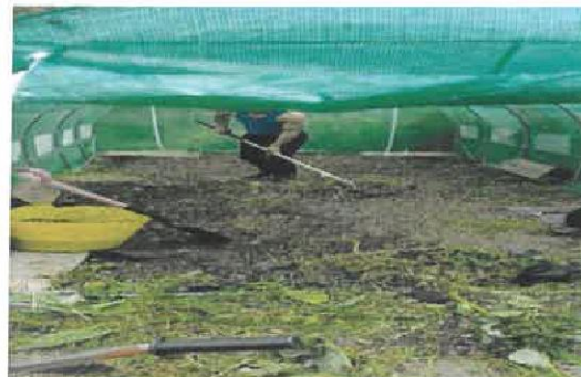
The Volunteers for the Allotment