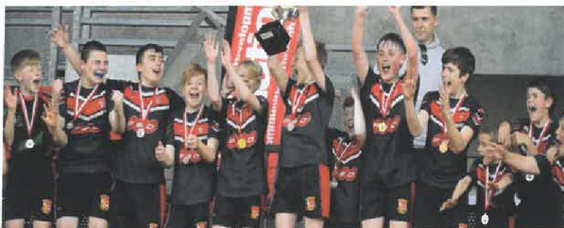
Winners of one of the boys St Helens schools Cup finals.