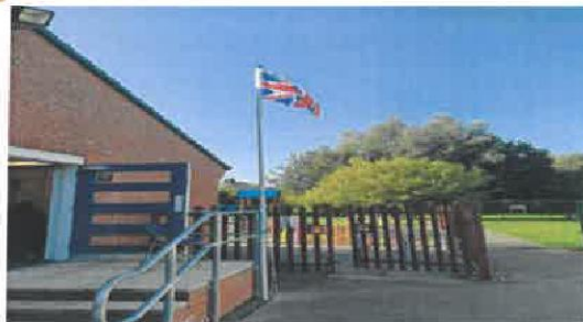
The Veterans Breakfast club