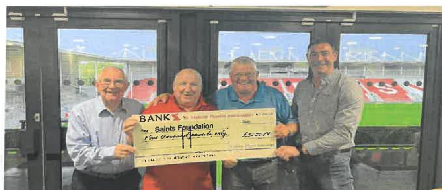
Players association present cheque to Foundation for Sponsorship of St Helens schools cup competitions

Our LDRL team has grown in numbers again this year, and in addition to the playing side the volunteer side has grown. Quite a few parents have caught the volunteering bug which helps the infrastructure of the team and the day to day running of the squad much easier. Our thanks go out to all our volunteers who take the time to make a difference in our own community, Thanks a million.