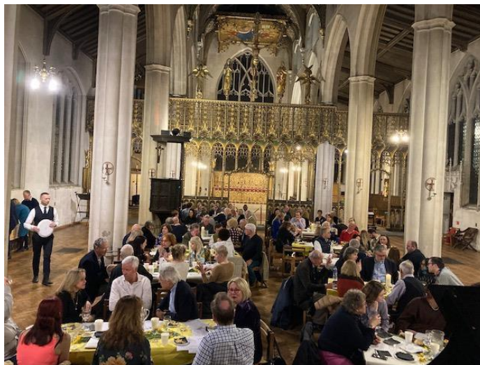
Wine tasting and opera evening in St Cyprian's

While the main church is an attractive space to hire (very much more so since the addition of the accessible facilities) the crypt room due to its size and layout attracts few independent bookings.