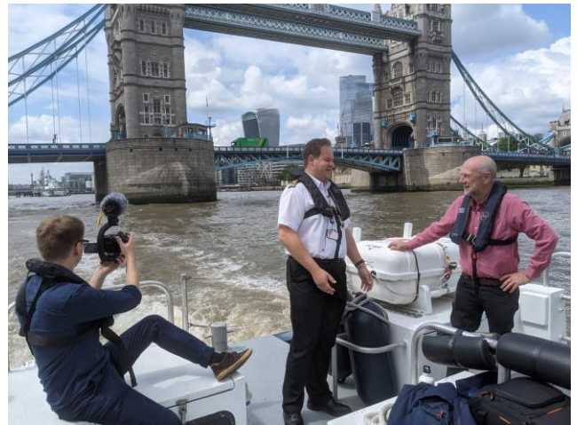
Filming for Bermondsey and Proud and Thankful

As the year went on it was encouraging to see things re starting and opening up opportunities for sharing the gospel. School assemblies resumed in person. Men's breakfast returned as did Bermondsey Brew, Wednesday night Church and RSG at St Anne's.