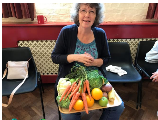
Ready Steady Grow Harvest Event

We didn't do the normal weekly craft, because it would have been getting people to close together, until we returned after the summer holidays.