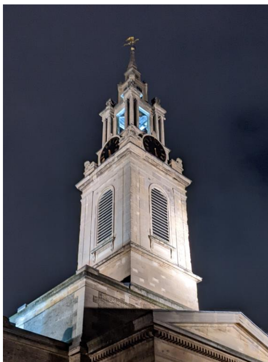
New floodlighting of St James tower

The Friends of St James Churchyard were asked to look at possibilities for upgrading the Garden of Remembrance, which is poorly maintained and often used inappropriately, for example by people letting their dogs exercise there. This is an ongoing issue. Cleaner Greener Southwark agreed a grant to renew the floodlighting in the churchyard, and this has now been completed.