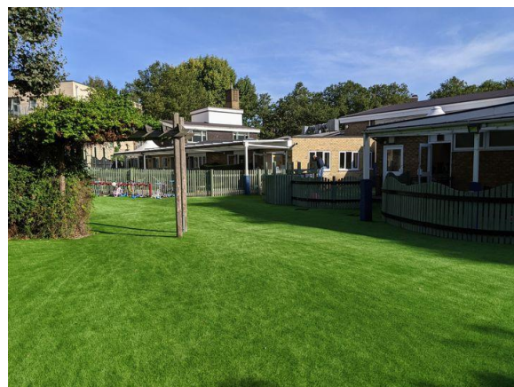
New playground surface at Old Jamaica Rd