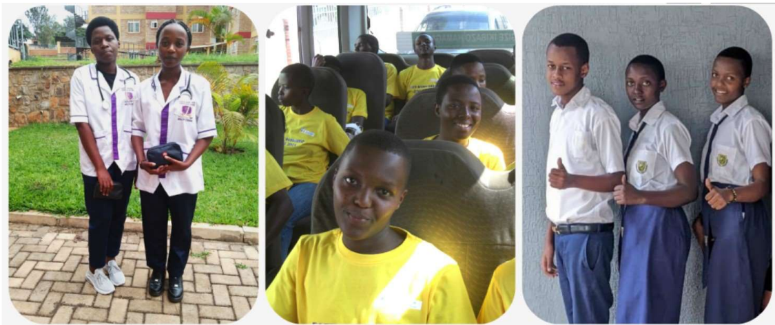
Ex-students during their hospital internship, and students at school and on a workshop trip

The Trustees have regard to the Charity Commission's public benefit guidance in exercising any powers or duties to which the guidance is relevant. There are no employed staff and none of the trustees receive any remuneration.