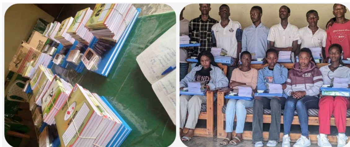
School materials assembled and distributed for a new term, September 2023

The charity's appointed local partner administers in-country activities comprising scheme promotion, completion of sponsorship forms, school visits, home visits and the administration of school fees, school materials and student travel expenses. The local partner has a dedicated bank account for the receipt and distribution of funds. Money is transferred on a termly basis.