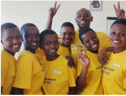
Students attending Workshop 2024, Musanze