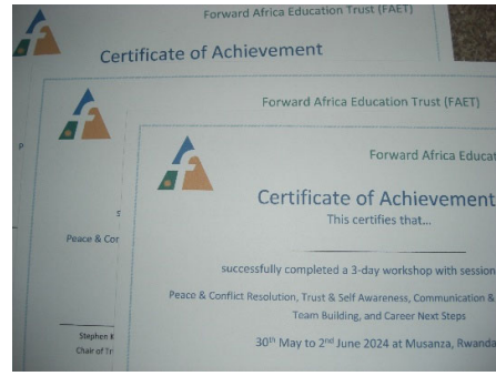
Certificates of Achievement