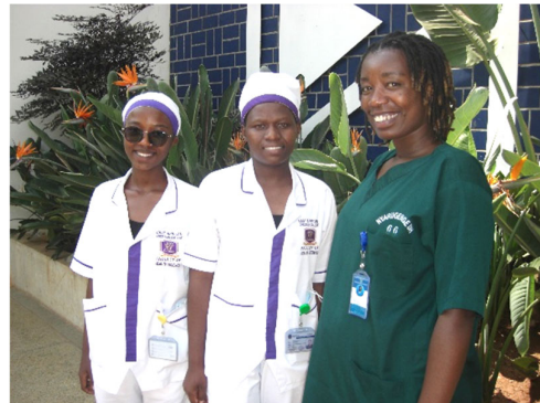
Students with their Director of Nursing, Kigali