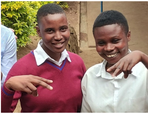
Two girls at George Fox School, Butaro

The Trustees consider the Charity Commission's public benefit guidance while carrying out their duties. No staff members are employed, and none of the trustees receive any form of payment.