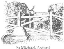
St Michael, Axford