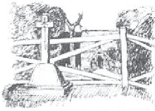
St Michael, Axford