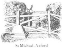
St Michael, Axford